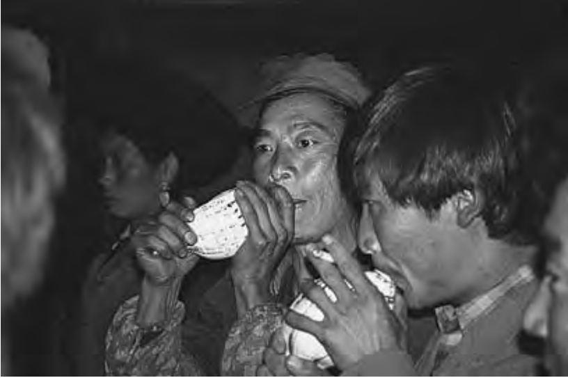
FIG. 21. Members of the groom's family blowing the conch shell at a Prmi wedding to celebrate the new union

riage with various groups in different places vary from free intermarriage to none at all. Prmi in Muli laughed at the suggestion that anyone would even consider marrying Hmong, and I know of very few marriages with Nuosu, even though Prmi seem to have no explicit prohibition. This may be due to the fact that the Nuosu prohibit such intermarriage in most situations. Intermarriage with Han is more ambiguous. As far as I know, Han people never prohibit marriage with any other group, and whereas Prmi in Shuzhu, a Prmi/Nuosu community in Muli that I visited, insisted that they had never had any intermarriage with Han or Nuosu, in Baiwu, Prmi-Han intermarriage is quite common.