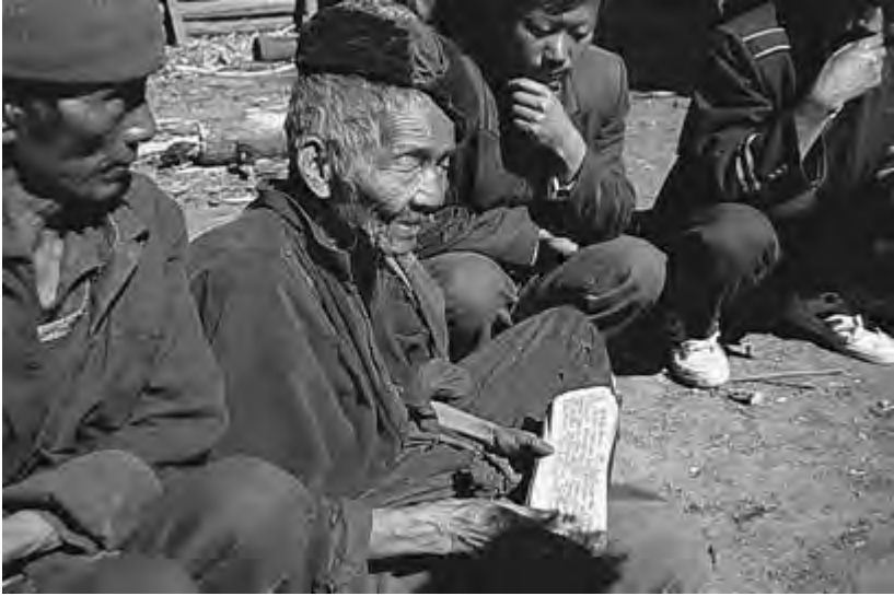
FIG. 17. An old Naze priest reading a Tibetan-language text

collection, but he freely admitted that he could understand only part of the content (fig. 17). Nevertheless, all Prmi and Naze in this area profess themselves Buddhists, and they all call upon Buddhist priests for funerals, ancestral rites, curing, and other rituals.