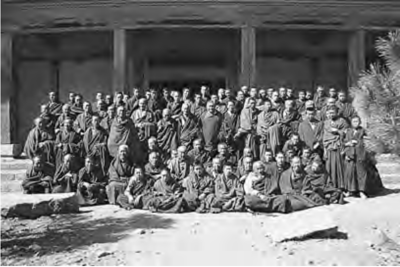
FIG. 16. The monks at the Yongning monastery

making efforts to translate old texts and perhaps to revive the use of the written language. 2