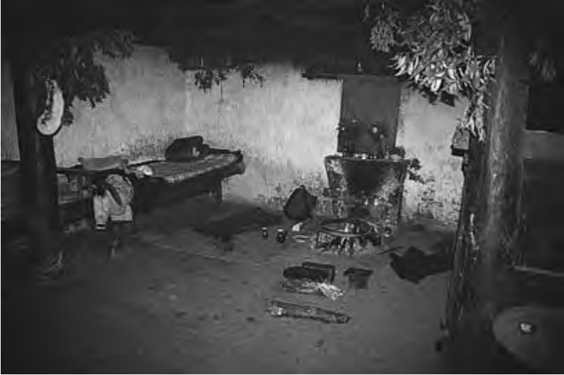
FIG. 19. The interior of a Prmi house near Baiwu, looking from the women's to the men's side of the room

hearth, surrounded by mats, and sometimes by chairs and tables, for sitting and eating. Altars to spirits and ancestors are on the left-hand wall as one enters the room, while Buddhist altars are directly above the hearth. There are no Naze in this immediate area, but there are both Nuosu and Han in the same village, and their houses have different, much less elaborate floor plans.