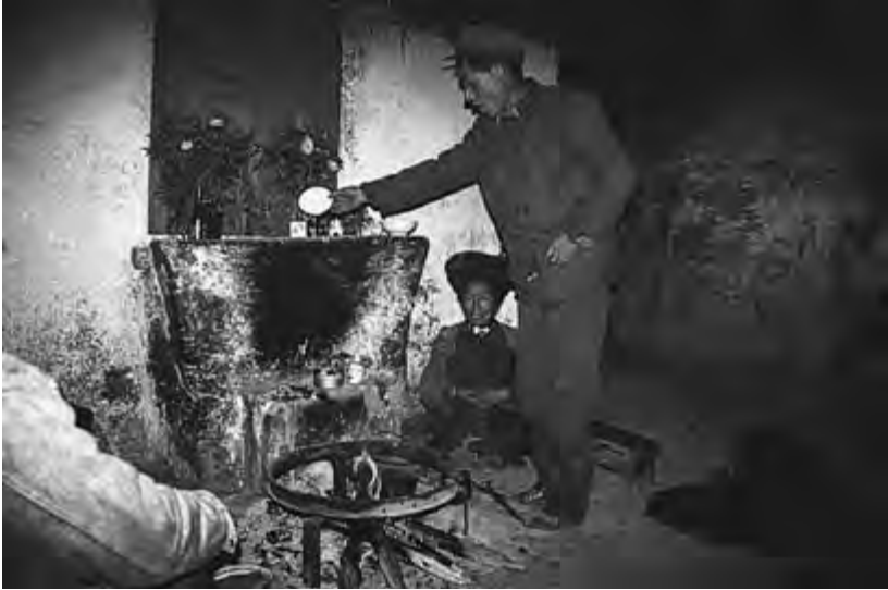
FIG. 20. The Prmi household head offering liquor to Zambala before a meal

There are other altars in the two corners of the house on the male side; the ones at the front are for ancestors and those at the back are for various earth and sky spirits. Han and Nuosu houses in these communities are fundamentally different from those of the Prmi and Naze in their layout—neither type has a conceptual division into male and female halves; Nuosu living space is divided into host and guest halves, and Han space, though marked by a single altar opposite the main door, is not divided by gender or social role. But both Naze and Naxi in this area build their homes with layout and ritual spaces identical to those used by the Prmi. 7