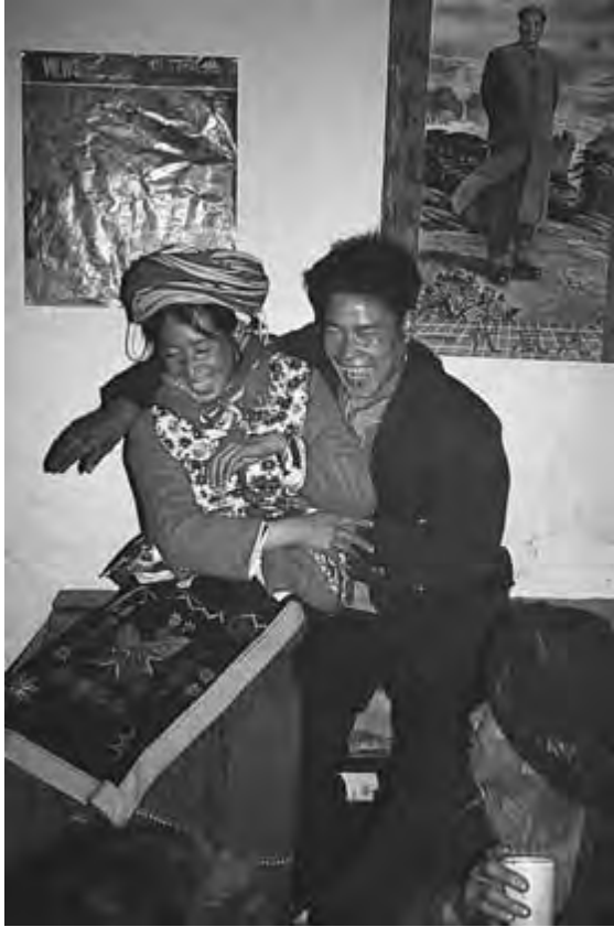
FIG. 18. A Prmi bride and groom clowning for the camera. She wears ceremonial dress.

design. On the other hand, when Prmi want to emphasize friendship with Nuosu, they can haul out the proverb “Everybody who wears skirts is one big family,” thus including Prmi and Nuosu in one category that excludes the Han. And even though many Prmi in Muli consider themselves to belong to the same Zang group as the Khams-pa or Ba, whom the Prmi call Gami, their dress is completely different.