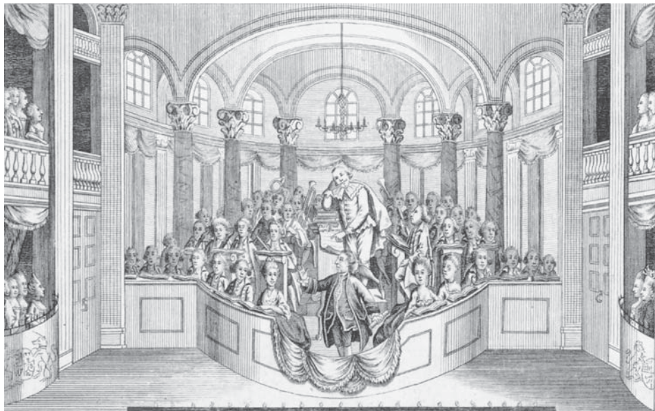
Figure 4.3. John Lodge, “Mr Garrick delivering his Ode, at Drury Lane Theatre, on dedicating a Building & erecting a Statue, to Shakespeare,” etching (1769). BM Ee,3.163.

the Grave” and then enacted by Mrs. Yates when she cites Garrick’s past performances either of the “Ode” or of Hamlet . These deictic moments are also thematized by the poem’s repeated investment in the capacity for pronouns such as we and you to shift meaning according to their moment of utterance. The act of pointing that is so crucial to reference here is a fundamental problematic in the “Monody” because it goes directly to the heart of the doubt elicited at the poem’s outset. Can we point to performance? The question is troubling because it necessarily raises questions about memory, forgetting, and the inexorable passage of time. Is fond remembrance still cherished here? Everything is calculated to heighten the anxiety generated by Mrs. Yates’s negotiation both with precursor performances, and with the nonliving props that surround her, in order to make the audience feel the precariousness of cultural memory.