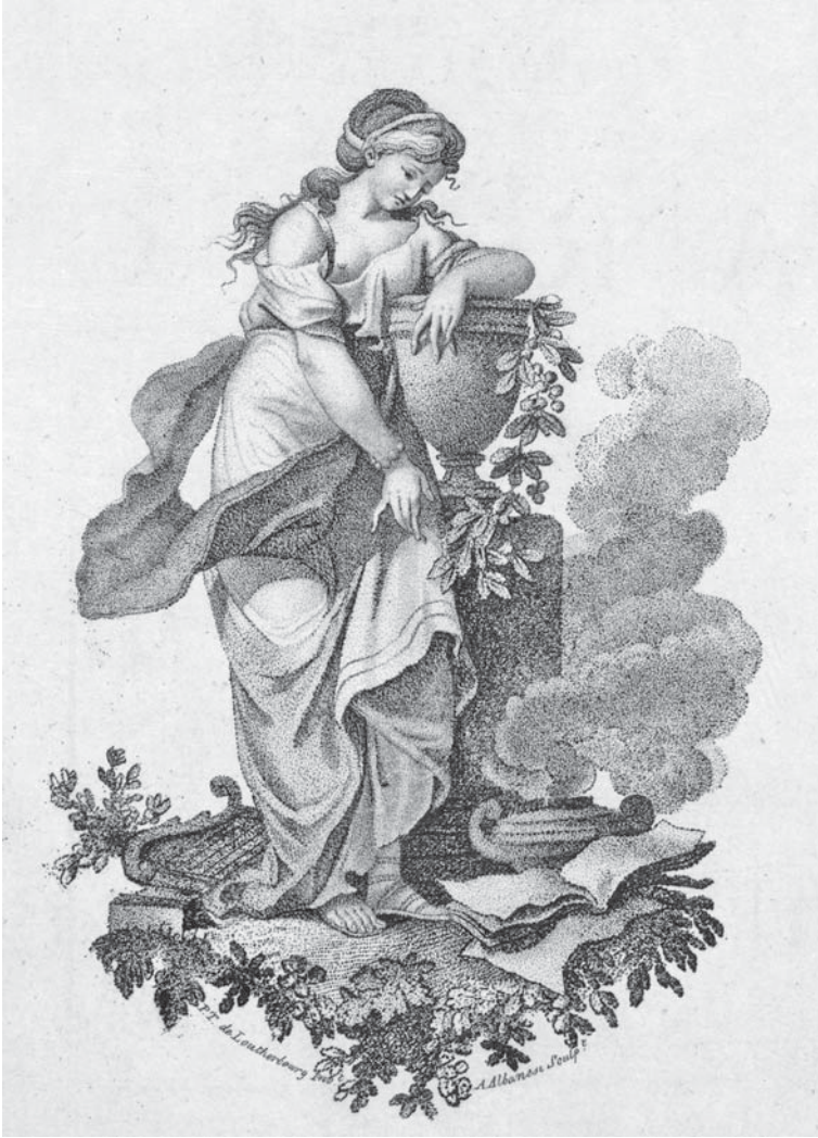
Figure 4.4. Frontispiece, Richard Brinsley Sheridan, Verses to the Memory of Garrick, spoken as a Monody (London, 1779).

built by De Louthembourg unraveled the claims for painting and sculpture's effective rememoration in the poem: "The coup d'oeil of the whole is good, but the monument, whether from its colouring, or from some other cause, does not produce the desired effect. The medallion also, which we understand to be an original picture of Mr. Garrick by Sir Joshua Reynolds . . . is scarcely distin-