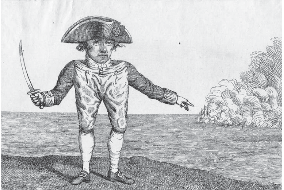
Figure 4.2. Anonymous, "Who's in Fault? (No Body) A View off Ushant," etching (1779). BM 5570. Department of Prints and Drawings © Trustees of the British Museum.

even of what precisely happened in the Channel remained unresolved. Clearly the rendering of Keppel without a body in the satirical print attempts to get at this problem less through equivocation than through a direct pun on the word "nobody" and the direct assertion of cowardice when it states that Keppel's "Heart was in his Breeches."