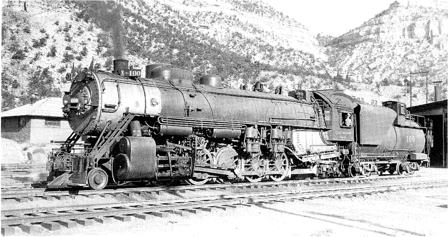
The Utah Railway 100, a 2-10-2, at Martins.