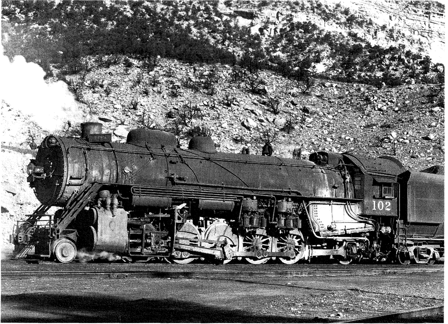
The Utah Railway 102.