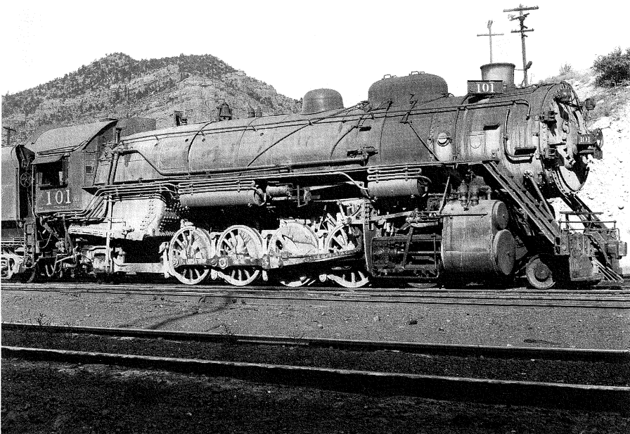
The Utah Railway 101.