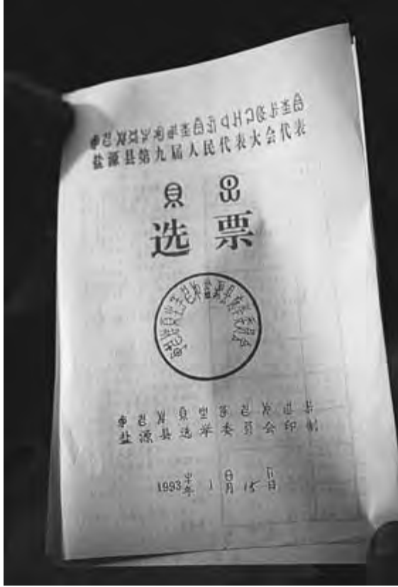
FIG. 3. A ballot for a local election in Baiwu, printed in Nuosu and Chinese

does not mean that there are no circumstantial factors encouraging Nuosu ethnicity; obviously there are economic, political, and educational benefits to being a minority in Reform Era China. What it does mean is that Nuosu people themselves understand ethnicity in primordial terms. They do not see it as contingent in any way. It is always, in every situation, abundantly clear who is Nuosu and who is not; there is no blurring or contextual shifting of boundaries (see also Schoenhals n.d.). In many places culture, as well as descent, is the thing that makes some people Nuosu and others Hxiemga. In these places Han culture is either resisted entirely (as in Mishi) or selectively practiced while its importance is denied (as in Baiwu). In Manshuiwan, Han culture has mostly