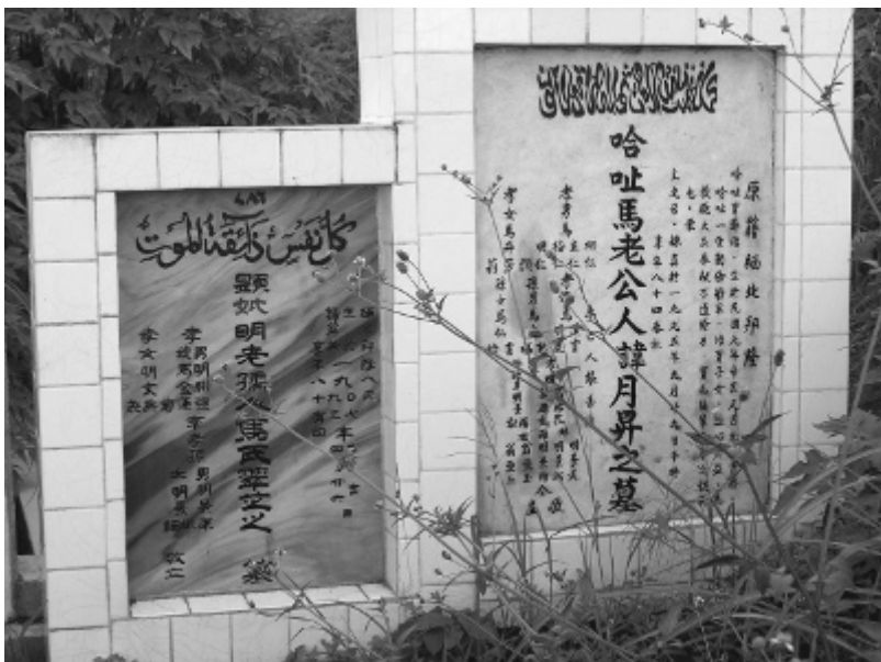
Figure 4-4. A Yunnanese Muslim's tomb in Pyin U Lwin