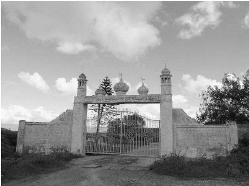
Figure 4-3. Muslim graveyard in Pyin U Lwin