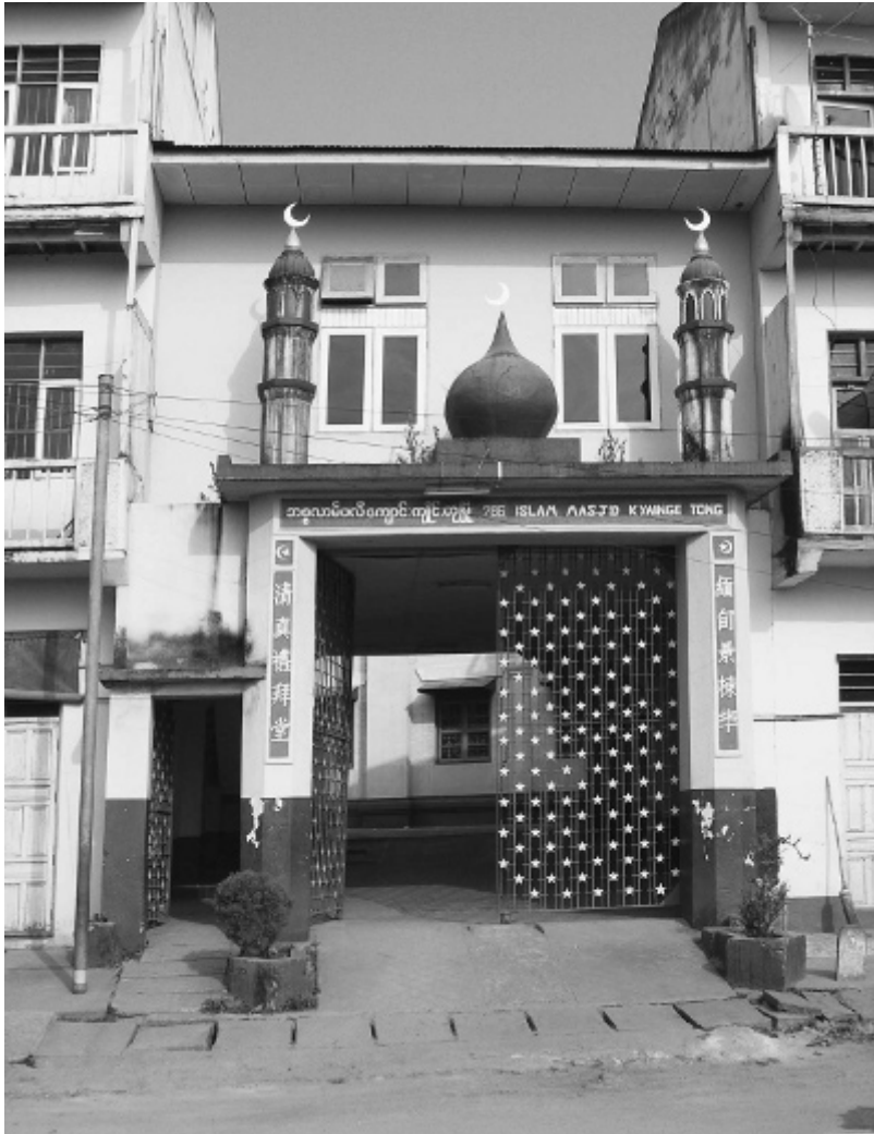
Figure 4–2. Panthay mosque in Kengtung

“How many children do you have?” I asked.