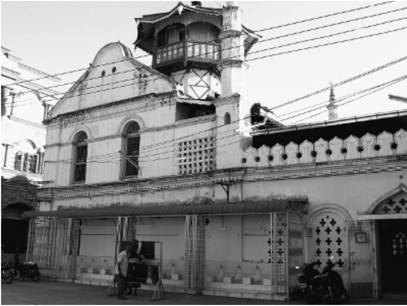
Figure 4-1. Panthay mosque in Mandalay

The Yunnanese Muslims are also called Yunnanese Hui or Huihui in China, and they belong to the Hanafi school of Sunni Islam (Suchart 2010, 111–14). The term Hui or Huihui became a popular name that referred to all Muslims since the Yuan period, and Islam was termed Hui jiao (religion of the Hui). But in 1954, the People's Republic of China created the Hui nationality ( huizu ) and limited its reference to “Sinicized” Muslims. The Hui are located in different parts of the country, and the Yunnanese Muslims are a part of that group. Over centuries, they have absorbed much of the dominant Han Chinese tradition in their everyday life as displayed in their language, dress, food, naming, and housing, among other things, while upholding their Islamic heritage. Apart from the Hui, there are Muslim groups whose members speak Turkic-Altaic and Indo-European Muslim languages in China—the Uighur, Kazakh, Dongxiang, Kirghiz, Salar, Tajik, Uzbek, Baoan, and Tatar (Gladney 1996, xv, 17–20; 2004, 101).