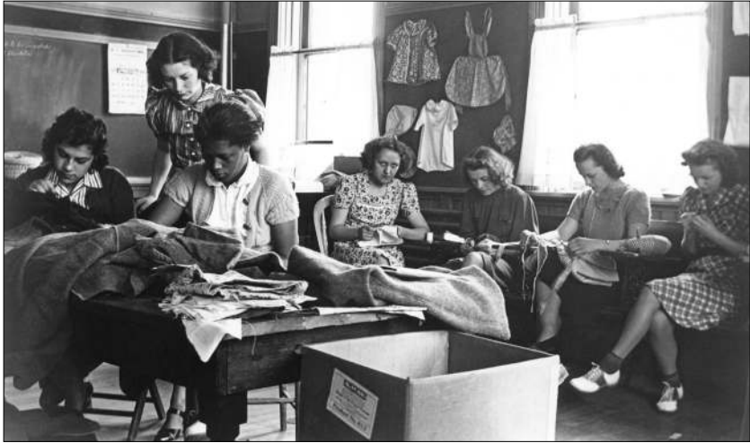
Figure 4.4 Women working on a WPA sewing project in Manistee County.