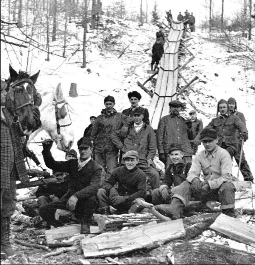
Figure 4.2 Workers on a Manistee County skidway project.

by New Deal work-relief agencies increased significantly by President Roosevelt's second term. African-Americans were able to secure jobs through the CWA, CCC, WPA, and NYA, and some were reluctant to accept employment in private industry because of the lack of discrimination on work projects. 23 A 1937 report on the projects of Michigan's National Youth Administration lauded the number (ninety-three total) of projects that included black youth. The projects, the report continued, included a variety of training opportunities, especially in Detroit, although whites benefited from training programs more than blacks. In August 1939, the majority of projects for blacks were in