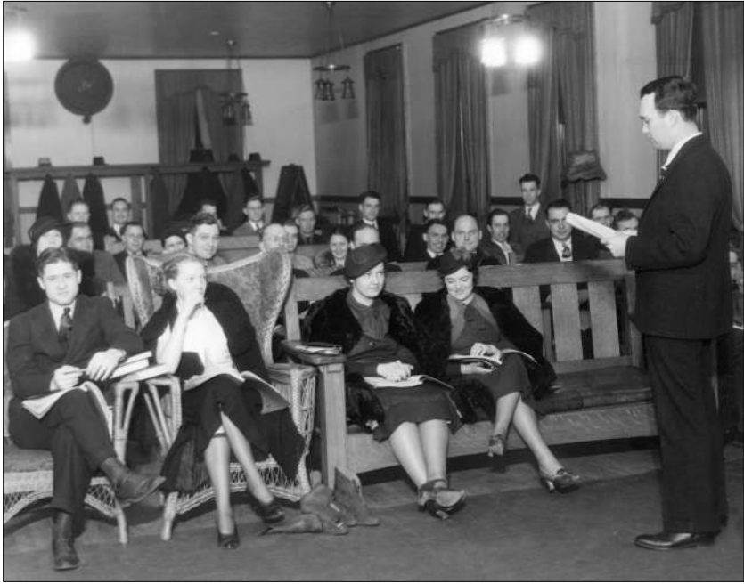
Figure 4.1 Participants in an aviation ground-school program offered through FERA and held at the REO Car Company Club house in Lansing.

thirty-seven new schools and repaired more than eighteen hundred others. They erected fifty-five municipal garages and twenty-three county and city halls, and built or repaired eighty-two bridges. Other projects spotlighted conservation programs and improvements to recreational facilities. Projects also employed white-collar workers in its educational and recreational programs. Workers also produced goods, from canned food to mattresses and clothing, which were distributed to relief families. 22 Work relief not only brought wages to families and injected money into local economies, but also resulted in visible improvements to local communities.