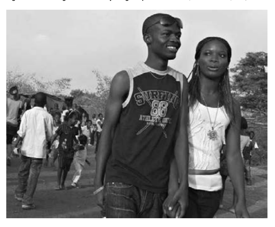
Figure 16 Looking to the future: young couple in Freetown, Sierra Leone, 2009