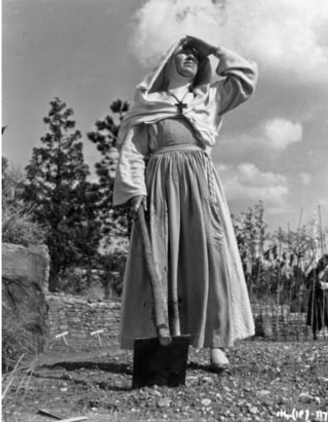
20. Mopu makes Sister Philippa see too far and remember forgotten things.