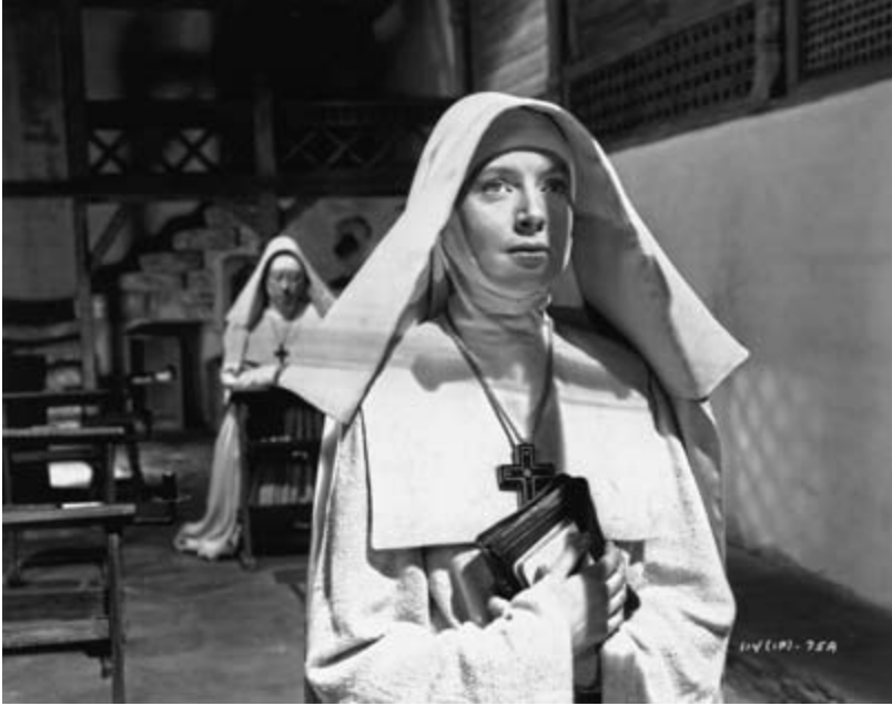
21. Sister Clodagh's mind strays from her prayers in Chapel.

amines him. He measures Marlow's head with great enthusiasm and takes down careful notes, remarking, "It would be interesting for science to watch the mental changes of individuals on the spot." 36 In Africa, Marlow feels himself "becoming scientifically interesting." 37 Similarly, in Black Narcissus the place (rather than Mr. Dean) circumscribes the nuns' efforts by catalyzing their preordained failure. "It's the wind," says Sister Clodagh, explaining her weakness in Mopu. "It's the altitude." "It's the place with its strange atmosphere and new people." "There must be something in the water," complains Sister Briony, though Mr. Dean informs them that the problem with Mopu's water is its purity. The place seeps into Sister Philippa's daily routine in the form of a clarity that disallows the necessary amnesia required for discipline and obedience to the order. She thinks too much, sees too much, and questions everything, including the value of her work. When she uses her work to push away "distractions," the calluses on her hands from excessive gardening become another way in which the place claims her body. Most vividly, Mopu possesses and consumes Sister Ruth. The place ingests her and spits her out, a different person. If Sister Clodagh's present blurs into her past, Sis-