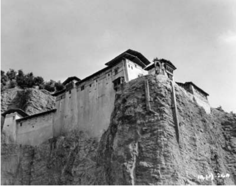
18. Mopu is created from stylized sets and miniature models.

As we dissolve back to the photographs of Mopu scattered on the Reverend Mother's table in Calcutta, we bring an awareness that Mopu's cast of characters are antithetical to the sisters in disposition, motivation, and just about everything else. We also have an uncomfortable feeling that the sketches and illustrations on the Reverend Mother's table don't begin to capture the spirit of the place. There is a sense that while we began the journey into Mopu through Sister Clodagh's vision and Mr. Dean's supercilious account, we have received a signal of the disparity between the actual place and its imaginings. The illustrations on the Reverend Mother's table make Mopu seem grand, while our vision of it has combined the indefinably large (the history of the place making itself felt through Angu Ayah, the fluttering curtains, the sensuality, the whispering spirit voices) with the ignominiously trivial (the peevish exchanges between the general, Mr. Dean, and Angu Ayah). Our encounter with the place is mediated by a combination of accounts given by the film's central characters and by incomplete glimpses provided by an anonymous entity (the camera, the narrative), leaving a presentiment that something about the place is not quite enclosed within the characters'