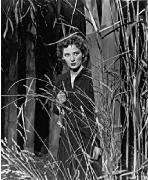
23. Sister Ruth lurks, transformed by her obsessions, her lipstick, and her red dress.

memories of Ireland—shown in breathtaking images of translucent shimmering water and in the deep, rich colors of her grandmother’s footstool and jewelry—make her sensibility the perfect conduit of the nuns’ experience of marginality and denaturalizing alienation in a strange land. 51 The film’s aesthetic modernism that thematizes this aspect of alienation could lead us to radical realizations of the “cultural imperialism within Europe that accompanies its domination over the rest of the world.” 52 But the film abandons a critical presentism for an emotional look ahead and a look back. As Sister Clodagh therapeutically anticipates future missions, her status as émigré within England and Mopu becomes a way of romanticizing her commitment to her faith. And the nostalgic tone of Dean and Clodagh’s last exchange leaves us with the distracting ache of their parting.