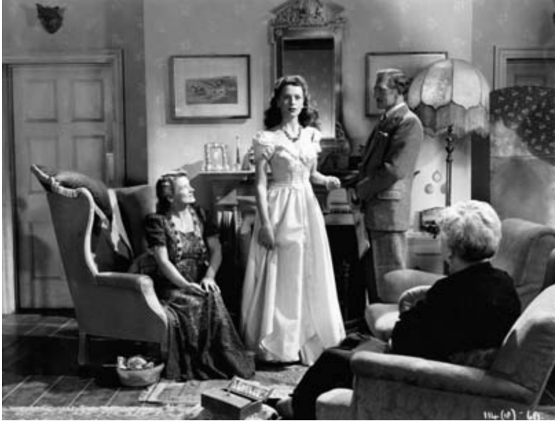
24. Sister Clodagh remembers trying on her grandmother's emerald necklace in Ireland.

mission fantasizes its own conclusion. Sister Ruth's death is its ultimate exorcism. It allows for a catharsis of the evils of the imperial encounter, but is still insufficient to recuperate imperialism's redemptive ideal. This redemption occurs through the character and the experiences of Sister Clodagh.