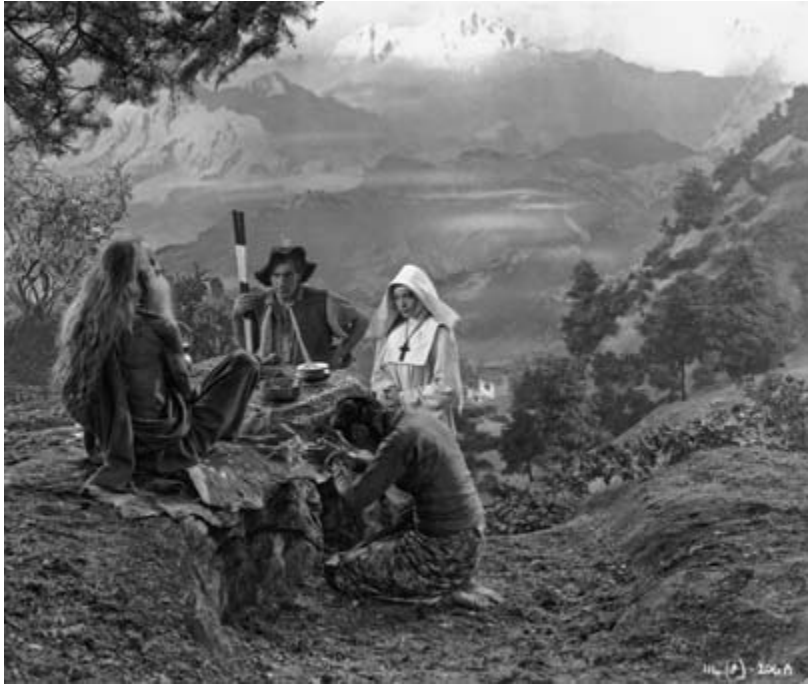
19. Dean and Sister Clodagh meet the Holy Man, the original owner of Mopu.

being a postlapsarian location of tempted virtue and knowledge, is a significant symbol in imperial cinema. To temporarily empty the symbol of its potential ambiguity, within imperial films the garden functions as a symbol of the colony (as an unkempt wilderness) or as a code for civilization (as a tended field). Similar to the ambiguities of Hollywood westerns (see chapter 5), we see how modernist imperial films offer complicated constructions of a colonial territory that will no longer fit into the latter half of a civilized/savage binary. The categories that the nuns wish to impose on the land simply do not hold, as brilliantly shown in the scene in which the half-naked, silent Holy Man is declared to be “General Sir Krishna Rai, KCBO, KCSI, KCMG, several foreign decorations, too,” a man conversant in English and several European languages, as well as the original owner of Mopu’s lands.