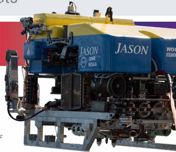
ROV Jason mid-launch.