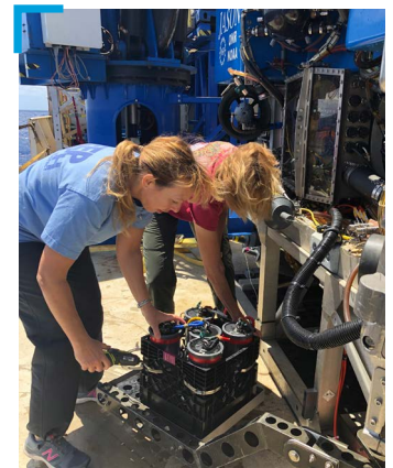
The science team removes coral quivers from the swing arm of ROV Jason . Coral quivers are containers designed to hold individual samples of coral.