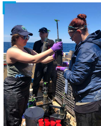
The science team holds a push core collected from Pamlico Canyon and places a rubber stopper in the bottom for safe storage before processing begins.

This octopus was seen at Pamlico Canyon.