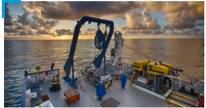
Team members at work launching ROV Argus.

Argus pilots control Hercules ' left arm, an ISE-brand manipulator arm, using a 12-key control pad. The Argus pilot also controls the lateral thrusters which swivel Argus and the tilt of the high-definition camera to provide variable views of the seafloor as well as keeping a close watch on the tether between vehicles. Another important role is to control the winch (the lifting drum which holds all the cable) onboard Nautilus to raise or lower Argus adjusting the 'delta,' or distance, between Argus and Hercules ' depths. Monitoring the delta depth ensures the tether doesn't get pulled tight and yank Hercules and prevents the ROVs from moving dangerously close together. Both pilots monitor systems looking for spikes or dips in oil pressure, temperature, and power to different systems like navigation, lights, cameras, or samplers.