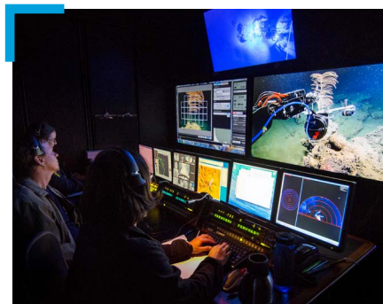
Team members at work in the control van aboard the E/V Nautilus .