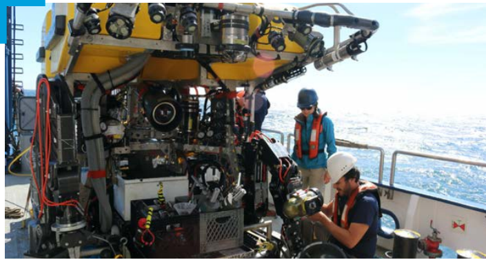
ROV Hercules team members installing camera.