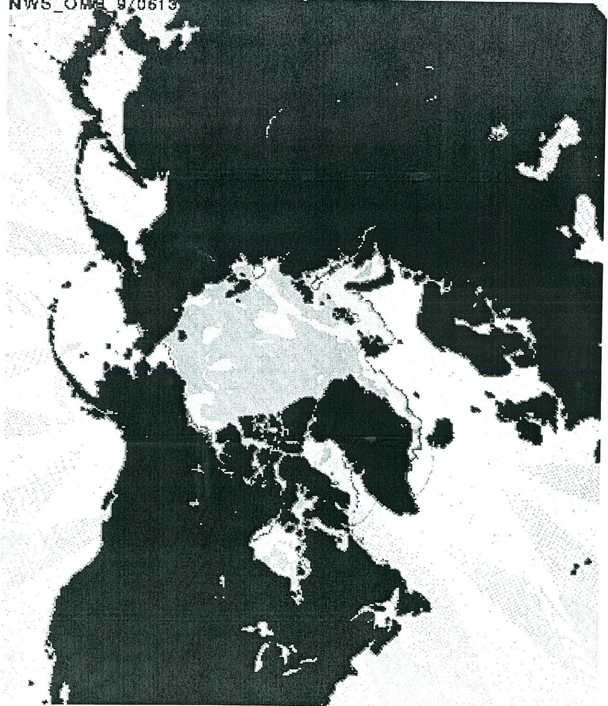
Figure 1: Northern Hemisphere ice concentration analysis as produced by the automated algorithm for 9 August 1996.