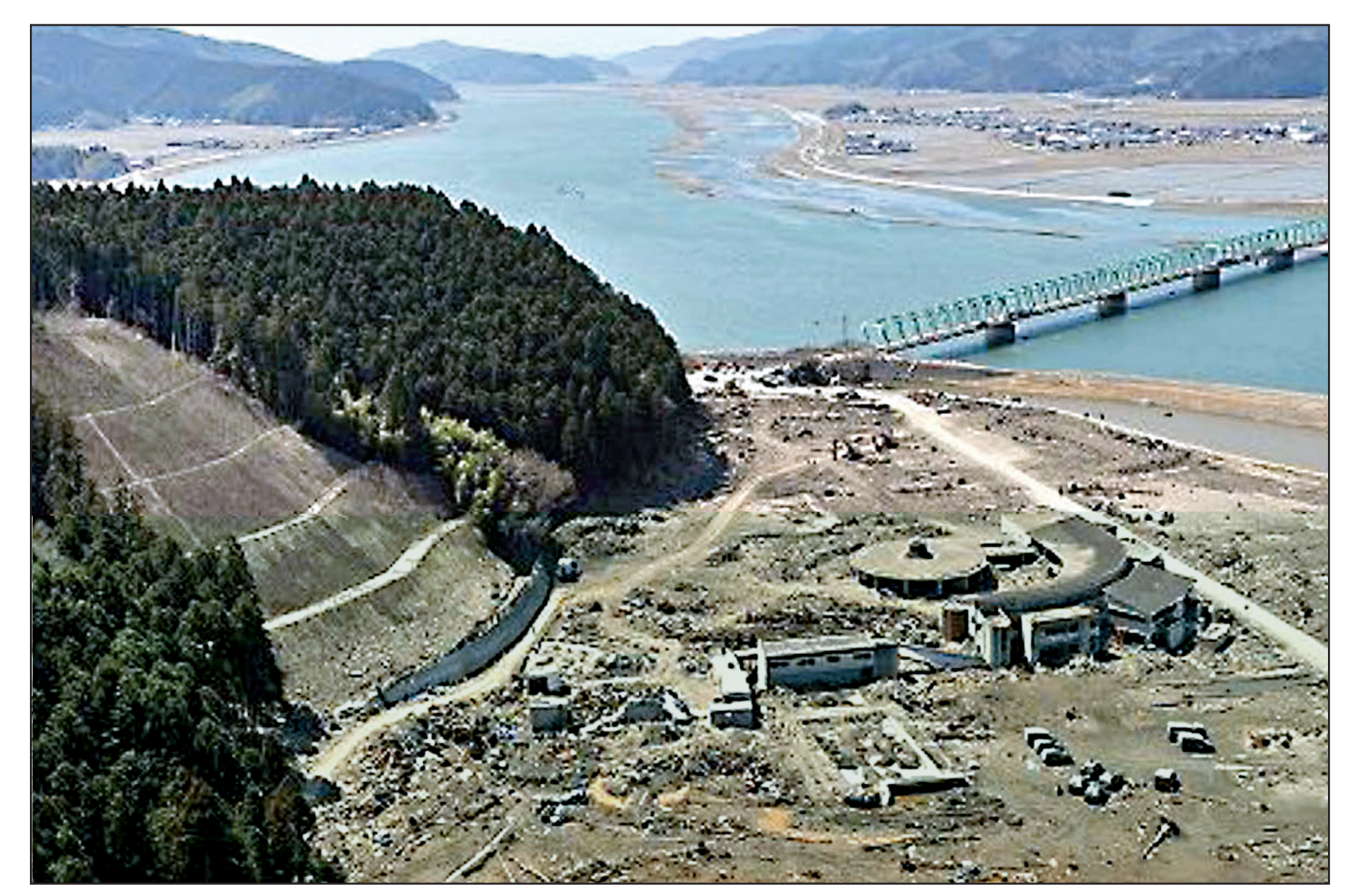
Students and staff at Okawa Elementary School weren't so lucky. The school had no tsunami plan and did not practice evacuation drills. Even though high ground was very close, 74 students and ten teachers died.