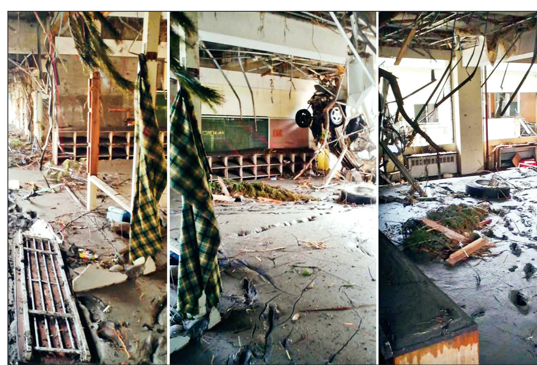
Debris from the tsunami, including a car, litters the third floor of the Kamaishi Junior High School.