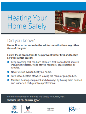
Home Heating Safety flyer English