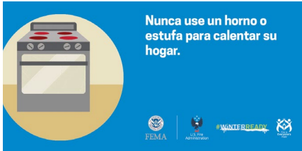
Never Use Your Oven Or Stove For Heat gif Spanish .