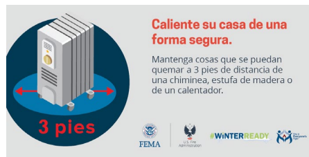
Heat Your Home Safely Spanish