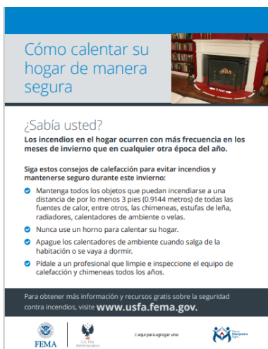
Home Heating Safety flyer Spanish