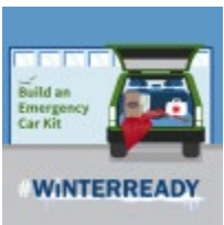
Build an Emergency Car Kit (Square) Download Graphic