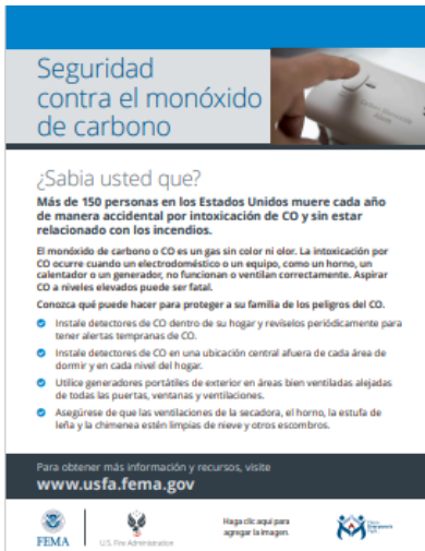
Carbon Monoxide Safety flyer Spanish