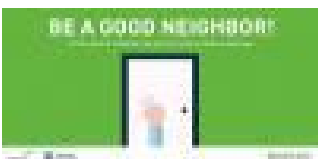
Be a Good Neighbor! Download Graphic