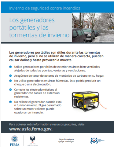
Portable Generators and Winter Storm flyer Spanish