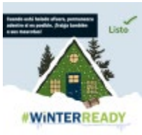
Stay Inside When It's Freezing (Spanish)(Square) Download Graphic