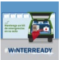
Build an Emergency Car Kit (Spanish)(Square) Download Graphic