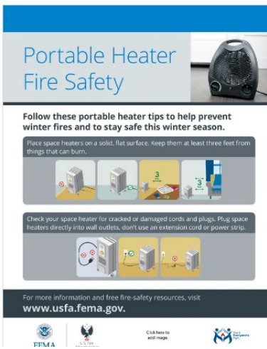
Portable Heater Safety flyer English