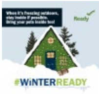
Stay Inside When It's Freezing (Square) Download Graphic