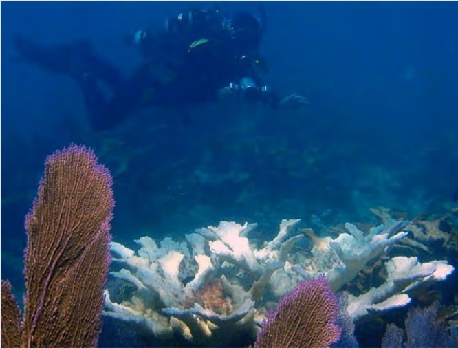
Corals in the sanctuary are expected to be exposed to bleaching conditions more often in the future.

Coral reefs are the foundation that supports much of the marine life and economy of the Florida Keys. These vibrant ecosystems provide habitat and food for hundreds of species including lobster, grouper, and snapper. However, coral mortality has accelerated in recent decades due to human and climate-related impacts.