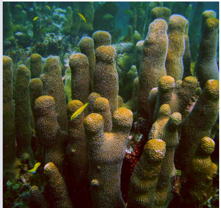
Endangered pillar coral is just one coral species threatened by warming water temperatures.

The projected increase in the intensity of La Niña events 19 may, in some instances, lead to more extreme cold events. In 2010, such an event caused catastrophic mortality of many fish, mangroves, and corals, killing up to 17% of the corals on some Keys reefs. 20