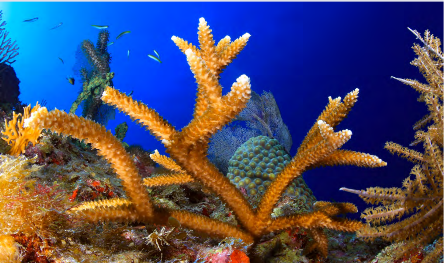
The corals of the Florida Keys face a number of climate change and human-induced threats.

Corals in the Keys are also threatened by stony coral tissue loss disease , which began in 2014 and is causing widespread death of nearly half of coral species found in Florida, including many that form the framework (or foundation) of the reefs. 21 High temperatures, combined with other climate and human-induced stressors, reduce the ability of corals to fight disease and could contribute to sustained or recurrent outbreaks. 17,22-24