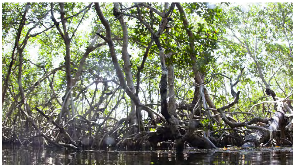
Mangroves, which are threatened by sea level rise, provide coastal protection and habitat for many ecologically and economical important species.

The low-lying islands of the Keys make the sanctuary particularly susceptible to rising waters. Species such as sea turtles and seabirds may lose important beach nesting habitat. 53 The extraordinary rate of expected sea level rise could outpace the ability of coastal ecosystems to keep up, leading to a reduction in mangroves that provide coastal protection and nursery habitat for ecologically and economically important species and their prey. 45,54 While the Keys' coral reefs are unlikely to drown in the near term, the rate of sea level rise, in combination with reduced coral growth due to acidification, could increase water depths over reefs up to 2.5 feet by 2100. 55 This would greatly reduce the coastline protection that the reefs now provide. 56