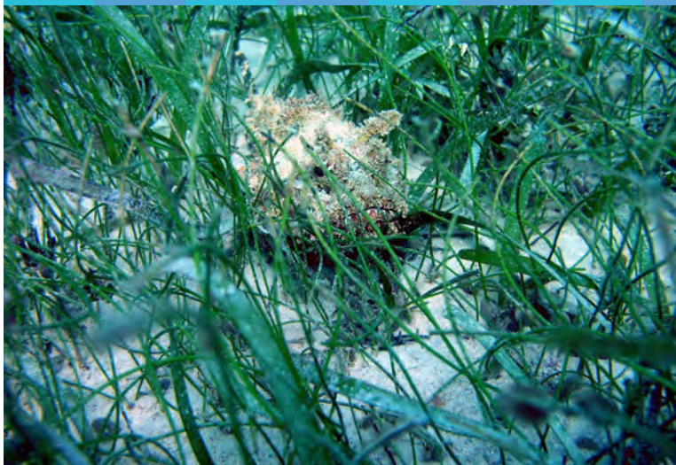
Strong storms and hurricanes can damage seagrasses, coral reefs, mangroves, and other ecosystems.

miles of the Florida Keys and an 8-10% chance that a hurricane will do so. 44,45 These probabilities are among the highest on Earth. While the effect of climate change on the number of tropical storms and hurricanes that occur in the region of the sanctuary is uncertain, the strength of these storms is projected to increase in the coming century. 1,41 Rapid intensification of storms, such as witnessed during Hurricane Michael in 2018, is also expected to occur more often. 1,46 Strong storms like Hurricane Irma in 2017, which made landfall in the lower Keys as a Category 4 storm, can cause extensive damage to infrastructure and the ecosystem. Such storms drive winds, waves, and storm surge, damaging coral, mangroves, seagrasses, and nesting habitat for sea turtles and birds. Rain and flooding brought by strong storms, tropical or otherwise, can lead to the runoff of nutrients and sediment from land into nearshore waters, increasing coral disease, 31,47 leading to algae blooms, 48,49 smothering corals and other bottom-dwelling species, 50,51 and causing coral bleaching. 32