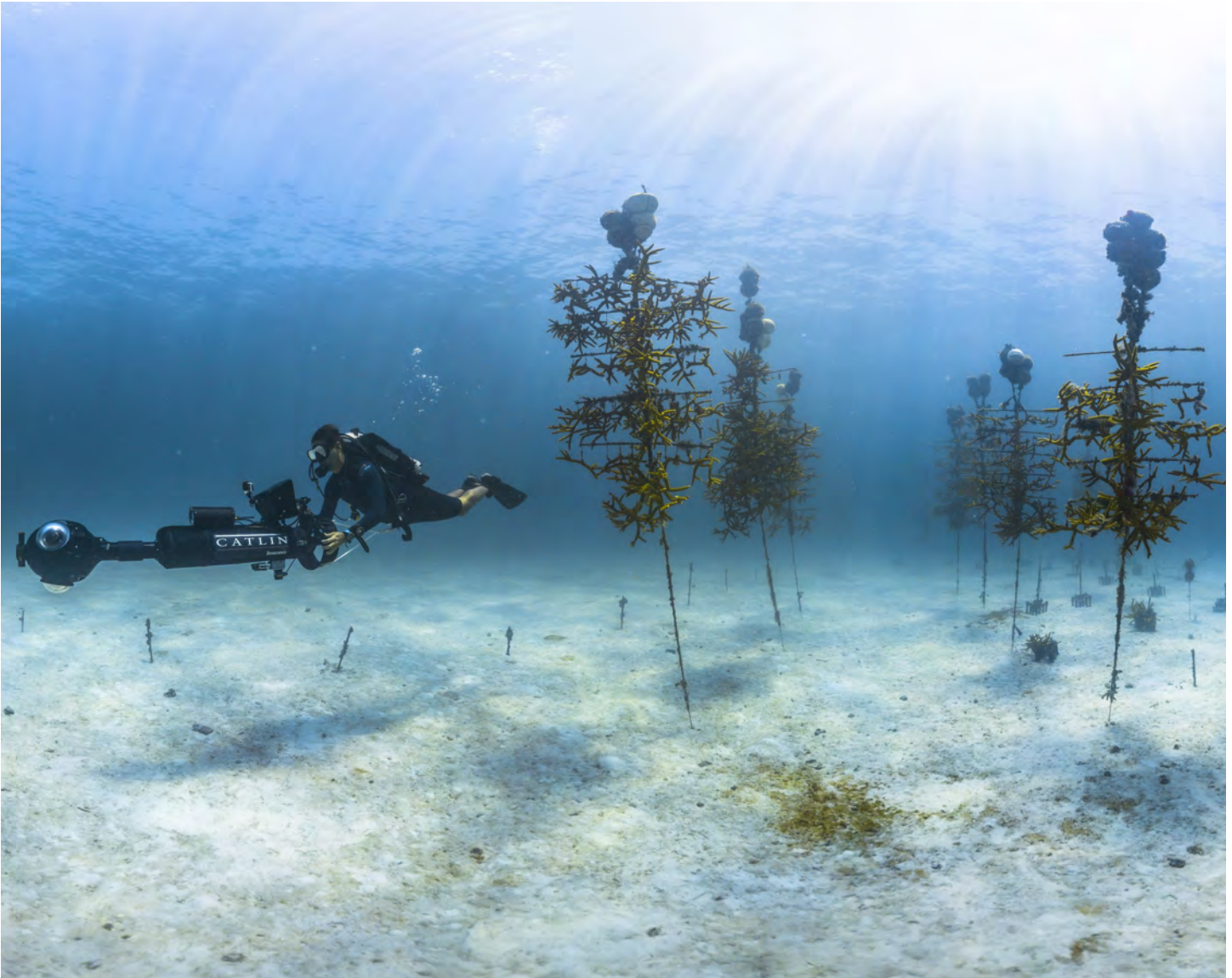
The sanctuary is involved in growing coral in nurseries to replenish reefs damaged by climate and other impacts.

The sanctuary works with the community, its partners from other agencies, and through the Water Quality Protection Program to improve water quality and reduce stressors such as impacts from vessels and divers, land-based pollution, overfishing, invasive species, and marine debris. It is vital to create and maintain an environment that minimizes all stressors to give organisms their best chance to resist climate change impacts.