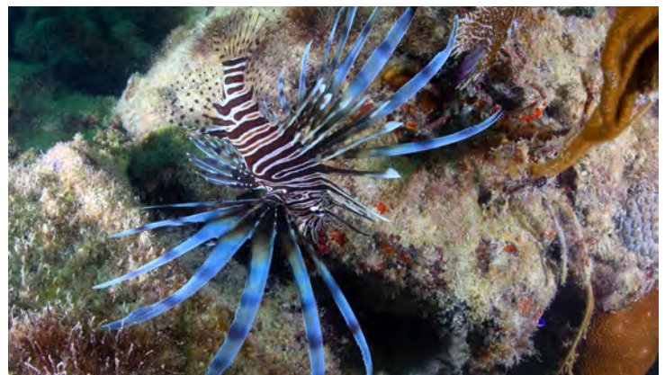
The impacts of lionfish, an invasive species in the sanctuary, may increase due to warmer water temperatures.

As temperatures rise, many species in the northern hemisphere are moving north or deeper to cooler water 4 . This could have ecosystem-level impacts. Heat-tolerant species may benefit from warmer waters while others that are not adapted to high temperatures may be negatively affected. 5,6 Warmer waters are also expected to negatively impact the larvae of Florida stone crab, 7 with potential consequences for the $30 million fishery this species supports. 7,8 Higher temperatures may increase the impact of invasive