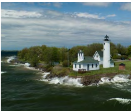
Tibbetts Point Lighthouse sits where Lake Ontario meets the St. Lawrence River.

Lake Ontario National Marine Sanctuary is America's 16th national marine sanctuary and the third in the Great Lakes. The area encompasses 1,722 square miles of eastern Lake Ontario waters and bottomlands adjacent to Jefferson, Oswego, Cayuga, and Wayne counties in the state of New York. Lake Ontario National Marine Sanctuary will celebrate the region's maritime cultural history and provide new opportunities for research, education, recreation, and maritime heritage-related tourism in local coastal communities.