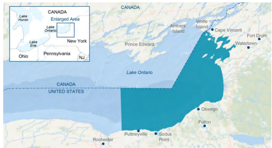
Lake Ontario National Marine Sanctuary encompasses 1,722 square miles of eastern Lake Ontario waters.

Eastern Lake Ontario is a historically rich area where the long relationship between human activity and the maritime environment has created meaning and a sense of place. An intriguing window into history lies on the shores and bottom of Lake Ontario. Forgotten shipwrecks and archaeological resources, hidden in these cold fresh waters, are among the best preserved in the world, offering a chance to learn, share, and connect to the past. The lands and waters hold cultural, spiritual, and historical significance to the Haudenosaunee Confederacy, who populated the area thousands of years ago.