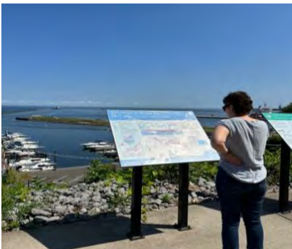
Visitors can learn more about maritime heritage in Oswego.