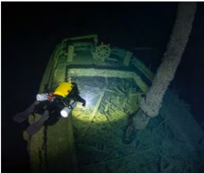
Queen of the Lakes remains upright and intact with all three masts still standing after sinking with a cargo of coal in 1906.