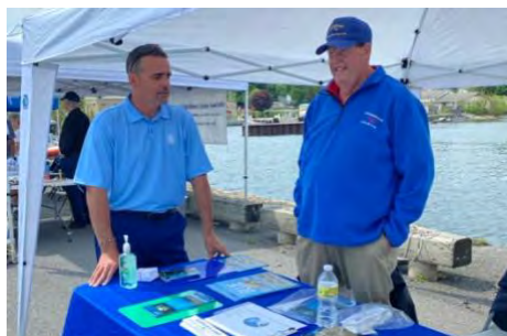
Sanctuary Advisory Council members volunteer at a NOAA display during an outreach event at the H. Lee White Maritime Museum in Oswego.