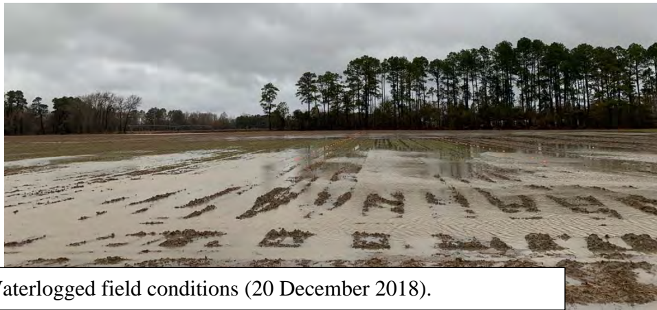
Fig 2. Waterlogged field conditions (20 December 2018).