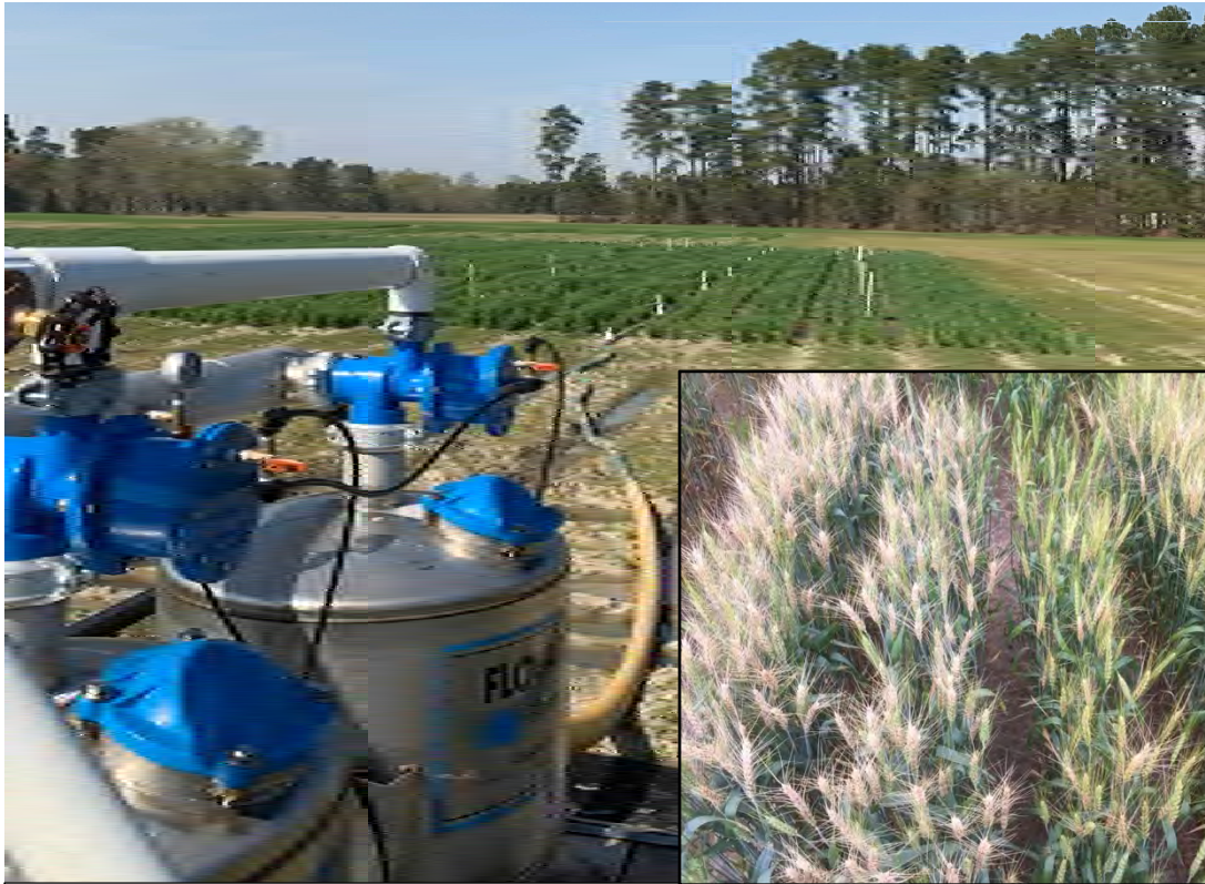
Fig 1. Scab nursery field design in Florence, South Carolina (29 March 2019).