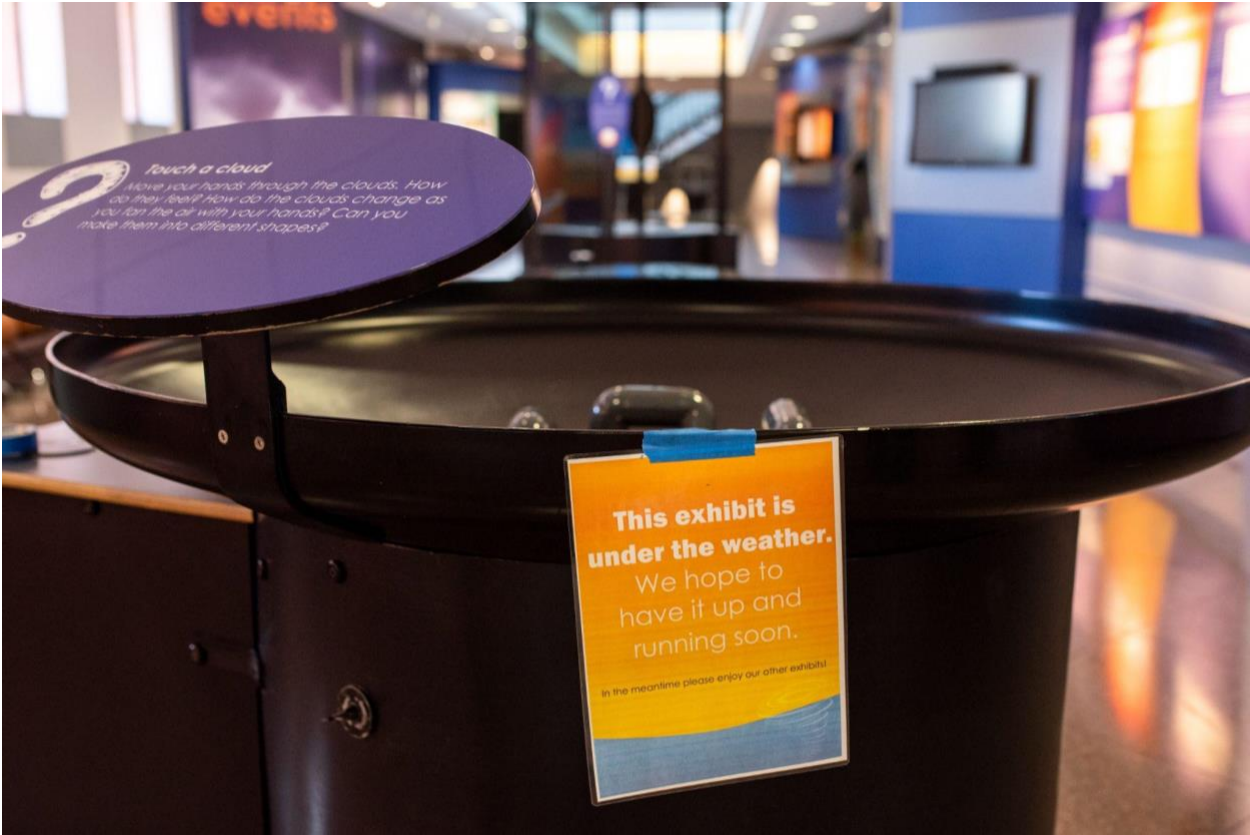
SIGN ON A BROKEN EXHIBIT

Sometimes an exhibit will be broken. When an exhibit is being fixed, we will not be able to use it. It is okay to feel disappointed if something is broken. We can visit a different exhibit!