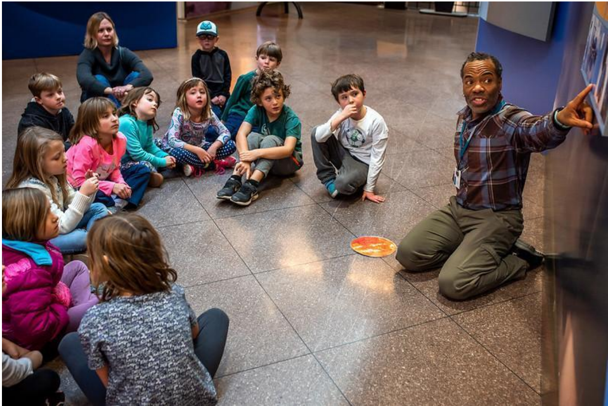
A GUIDE TEACHES STUDENTS ABOUT WEATHER AND CLIMATE

Our guide will take us around the exhibits and have a conversation about what we see. We will learn about weather and climate. We can ask questions and be curious!