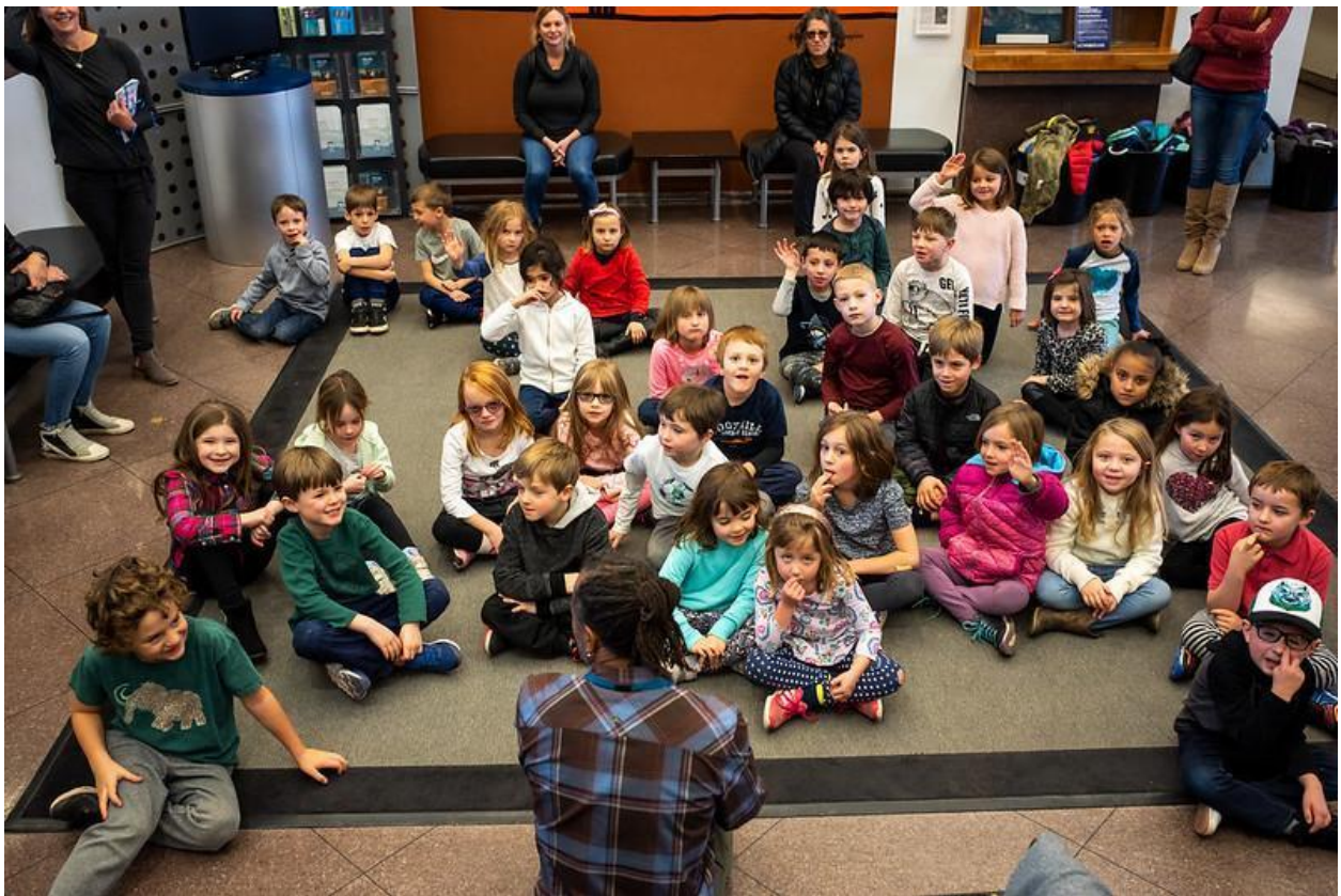
A CLASS GATHERED ON THE RUG IN THE LOBBY

Our guide will share important information for our visit.