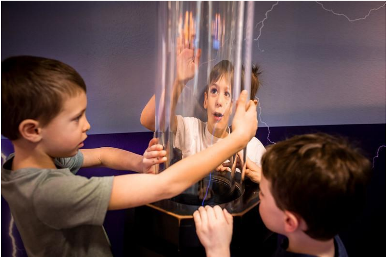
STUDENTS TOUCH AN EXHIBIT ABOUT WEATHER

I will be able to explore the exhibits with my group. Our guide might give us something to look for. We can touch the exhibits. Some of the exhibits have games we can play. This is a great time to explore!