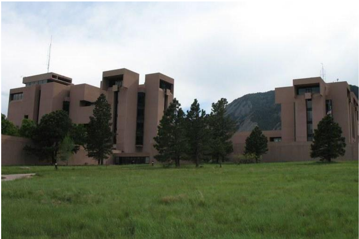
NCAR MESA LAB FROM THE PARKING LOT