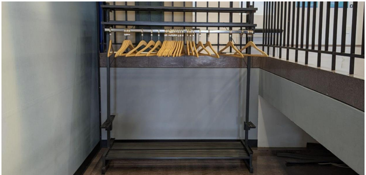
RECEPTIONIST IN THE LOBBY (ABOVE) COAT RACK (BELOW)