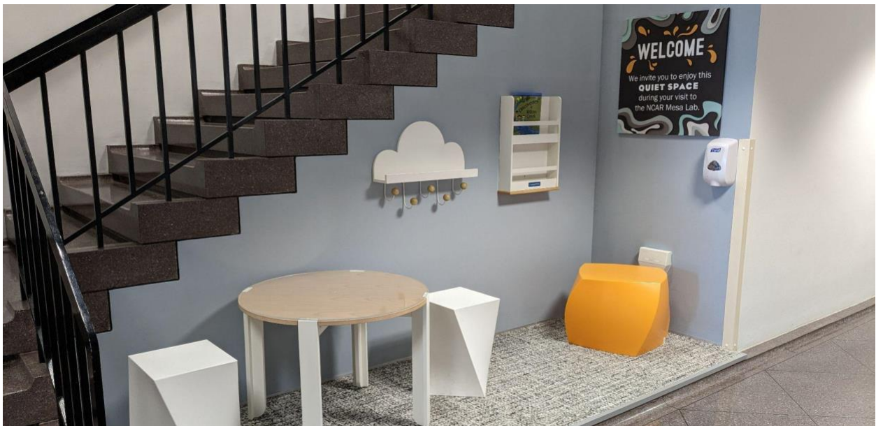
NCAR LIBRARY (ABOVE, CLOSED ON WEEKENDS) QUIET SPACE NEAR CLASSROOM 135 (BELOW)