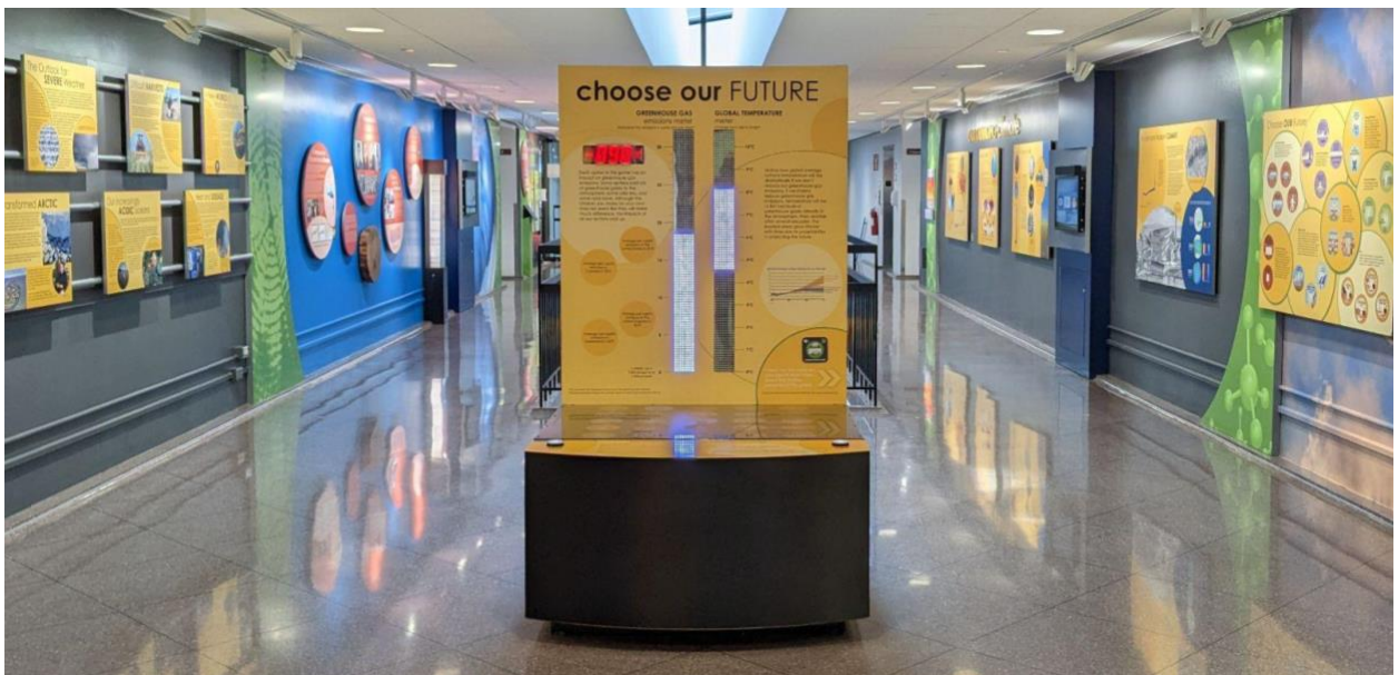
WEATHER EXHIBIT (ABOVE) GAME IN THE CLIMATE EXHIBIT (BELOW)