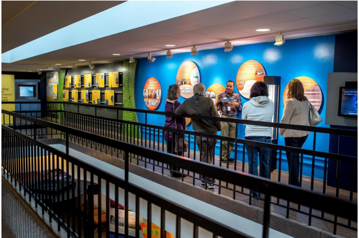
GUIDE GIVING A TOUR OF THE CLIMATE CHANGE EXHIBIT

The guide will take us around the exhibits and have a conversation about what we see. We will learn about weather and climate. I can be curious and raise my hand to ask questions at any time.