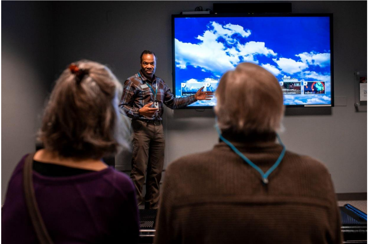
A MOVIE IN THE NCAR THEATER

I can go to the theater to watch a movie. There might be parts of the movie that are loud. If it's too loud, I can leave the theater.