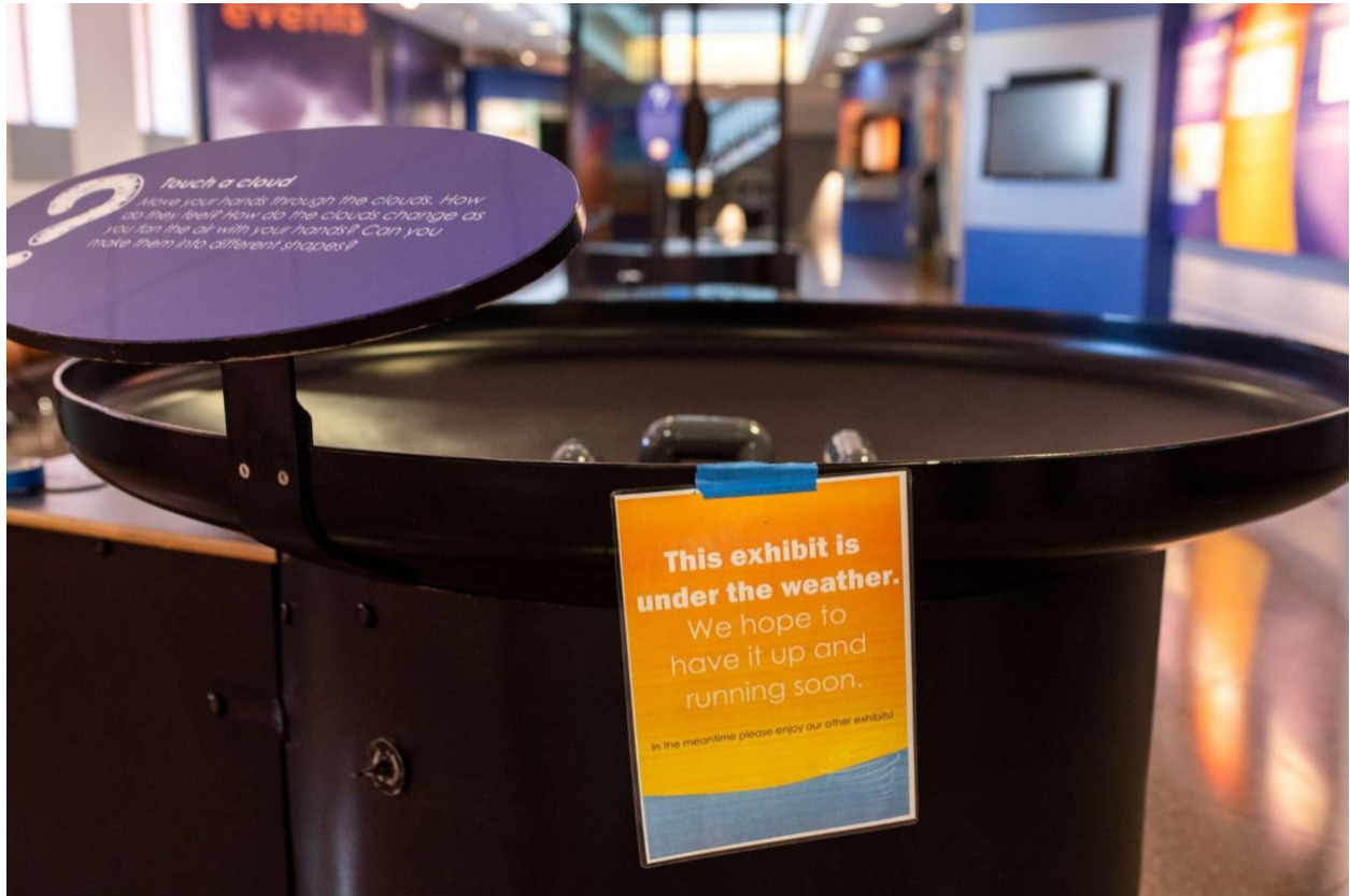
SIGN ON A BROKEN EXHIBIT

Sometimes an exhibit will be broken. When an exhibit is being fixed, I will not be able to use it. It is okay to feel disappointed if something is broken. I can visit a different exhibit.