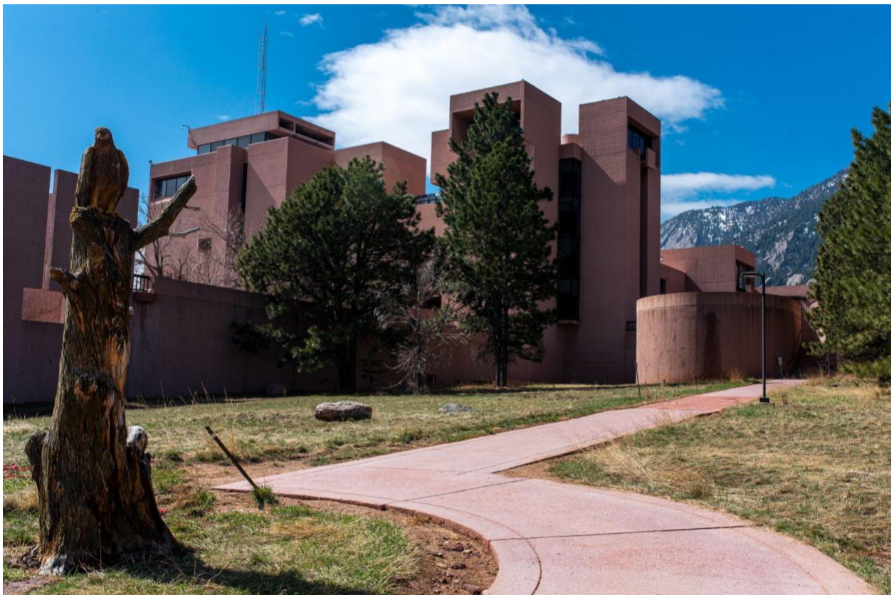
NCAR MESA LAB FROM THE SIDEWALK

I will walk up a hill and some stairs to enter the building.