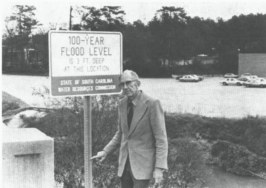
STATE CLIMATOLOGIST, JOHN PURVIS, POINTS OUT 100-YEAR FLOOD LEVEL AT COLUMBIA SHOPPING CENTER.

Water resources management requires knowledge of climate data. Water, taken for granted in South Carolina because of its abundance, has been termed the State's greatest natural resource. Overuse and abuse of this vital resource is rapidly pushing State government authorities into a position where they must take a hard look at the problem and somehow try to balance the demand with supply. The State Climatologist's resources and expertise are being used to help develop a State Water Plan that, hopefully, will address the total water supply and demand for South Carolina.