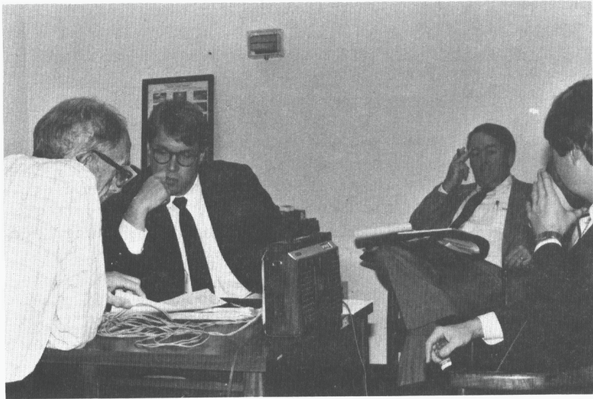
CLIMATE SERVICE TO THE LEGAL COMMUNITY IS A REGULAR FUNCTION OF THE STATE CLIMATOLOGIST.