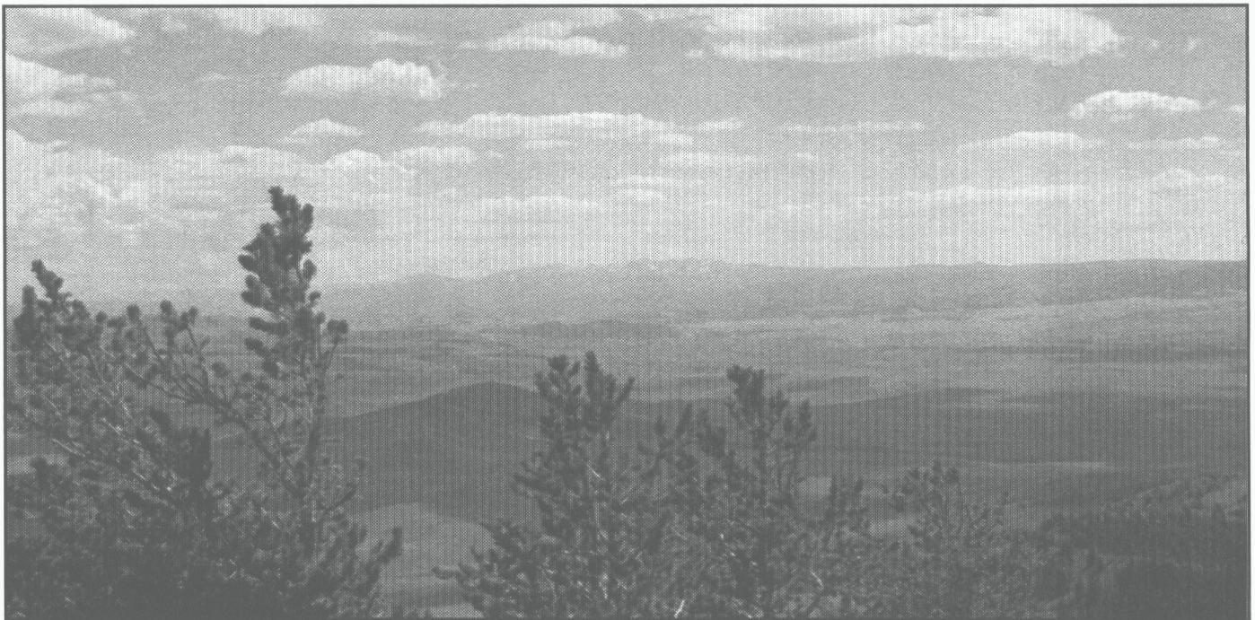
Figure 1. A view of Wyoming.

Five of the six regional climate centers (RCC) gave the group updates on their activities. Kelly Redmond (Western RCC) reported that they handle about 35-50 requests per day. Data is provided free of charge to SCs and the NWS. The NWS is the biggest user of their on-line system (WESCLIM), but the SCs also make considerable use of the system. Ken Hubbard (High Plains CC) gave a run-down of his center's current research projects. They field 150-200 requests per month and record about 5000 accesses per month on their on-line system. Warren Knapp (Northeast RCC) reported that the center had to eliminate some services that were previously free due to budget cuts. Research