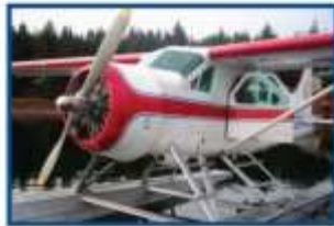
ABOVE: A photo of the Beaver floatplane in Igropev, Alaska

education to migrant Guatemalans in the past, and see a great need there as well for providers."