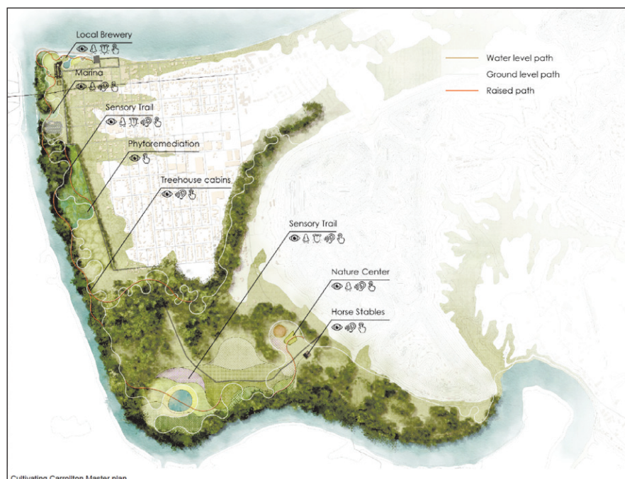
Cultivating Carrollton created a master plan from the confluence of the Kentucky and Ohio Rivers up the Lock #1 on the Kentucky River.