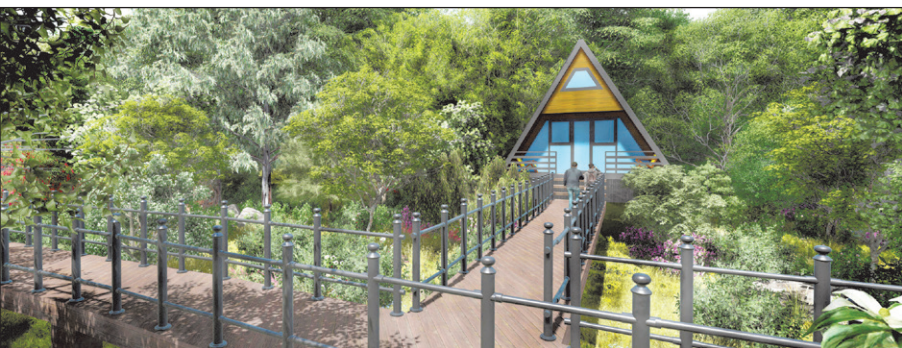
The design called for treehouse to be closer to the Lock #1. They would be above flood level and have a elevated walkway for a zero entry.