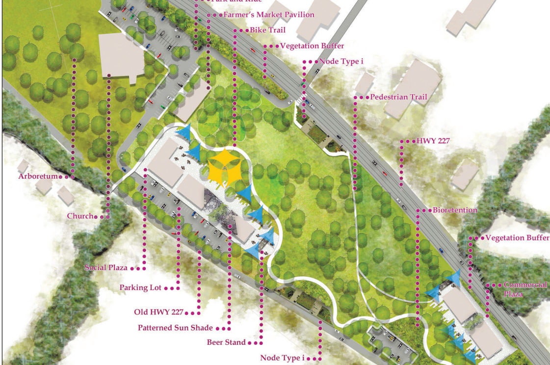
This is an overview of the team's design.

As earlier reported this project did not start because of CEDIK. This project started