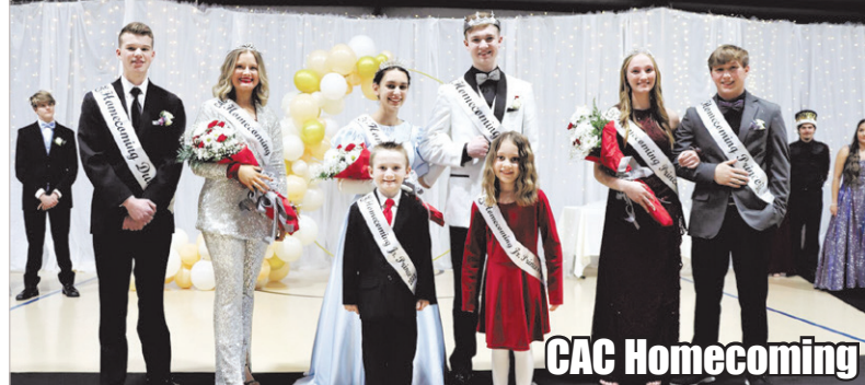
CAC Homecoming See Page B1