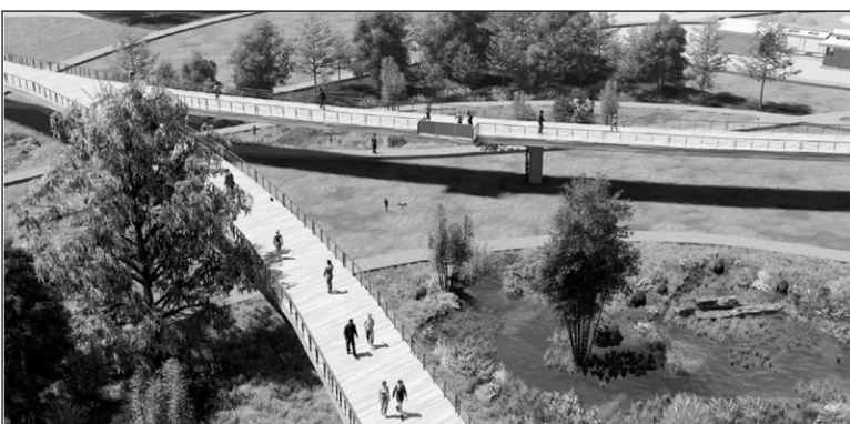
There is an elevated walkway spanning 0.5 miles at the confluence of the Kentucky and Ohio Rivers.