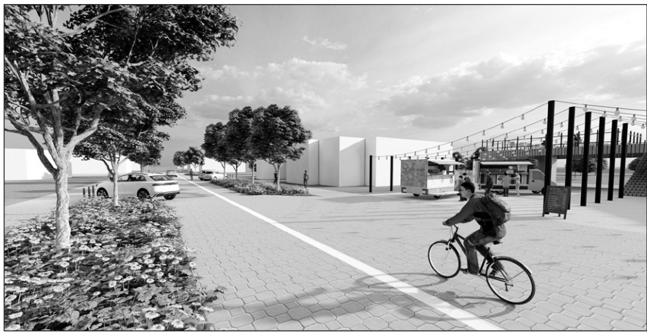
A street level view of Main Street.