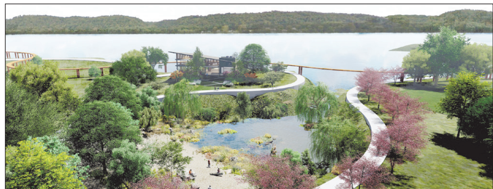
This is an elevated view of the small inlet created for soft launching of canoes and kayaks on the Ohio River.

Implementation of the design would be an term term development plan requiring some outside investment.