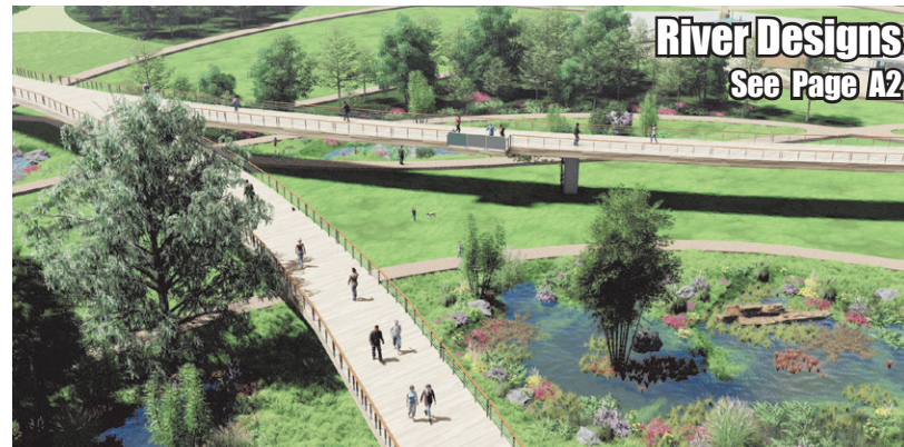
River Designs See Page A2