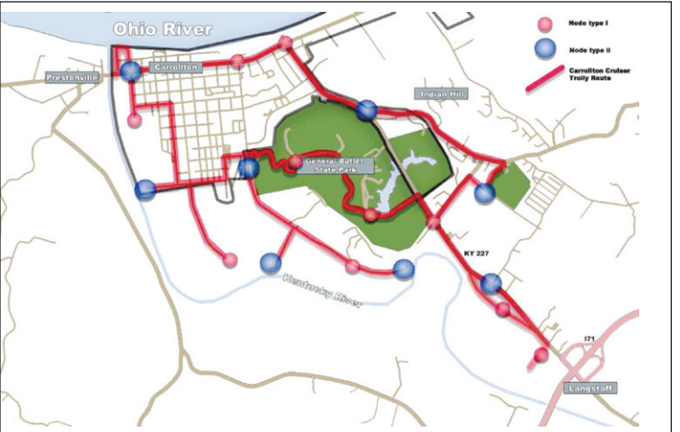
This drawing shows the node stops for the Carrollton Cruiser. The larger blue circles are type 2 stops with park and ride capabilities. The smaller red circles are type 2 stops which are trolley passenger stops.

Editorial note: After listening to the student presentations and then visiting the students on-campus for more detailed interviews, there were two things that really stood out. The first was the students came in with no preconceived ideas, with a wide open vision, and no blinders of what downtown Carrollton could be. The second thing is they have no concept of the volume of water that a flooding brings to downtown and Point Park.