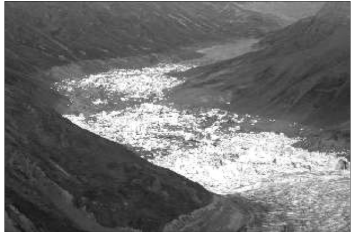
Drained glacier dammed lake that forms at Tazlina Glacier

Jim Coe, Becky Perry, and Britta Hinrichsen conducted a field survey of the Tazlina River near Glennallen on August 9 to determine the validity of the published flood stage. The river had risen sharply to above flood stage early in August as a result of releases from two to four of the river's contributing glacier dammed lakes, but public feedback indicated there was no flooding. The survey identified that changes in the river channel and other factors have made the published flood stage obsolete, so coordination will begin on redefining an action or flood stage for the river reach.