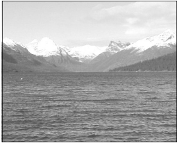
The Alaska Range overlooks Chelatna Lake

Lake and river levels in the area were extremely low. The pilot reported the lowest lake level he has seen in his 25 years of flying.