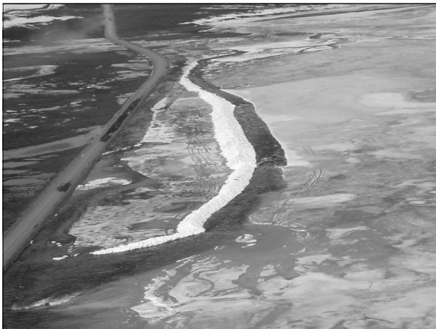
DOT built a snow dike to keep runoff from washing out the Dalton Hwy.

Significant overflow icing developed through the winter on the Sagavanirktok River adjacent to the Dalton Highway near Pump Station 3 on the north side of the Brooks Range. The overflow ice came out of the river channel for nearly 15 miles north of Pump Station 3, and resulted in over 2 feet of ice on the surrounding tundra. The Department of Transportation (DOT) spent many hours in the latter half of the winter trying to keep the ice from overtaking the Dalton Highway. Temperatures well above freezing in mid-May brought rapid snowmelt and runoff into the Sagavanirktok drainage. With the river channel and surrounding tundra clogged with ice, water spread out over a large area and began to inundate the highway. Fortunately DOT was able to cut multiple channels in the ice to divert the water, as well as construct a series of dikes from snow and ice in order to prevent the water from washing out the only road to the north slope oil fields.