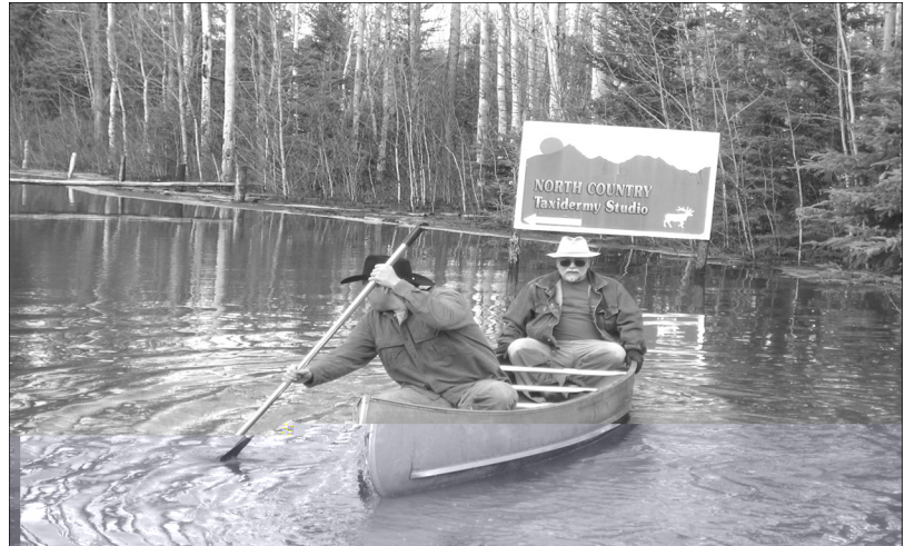
Some Delta residents could only reach their homes by canoe for several days.

An unusually heavy rain event (more than 1 inch) in early May, combined with temperatures well above freezing high up in the Alaska Range, resulted in the worst flooding in 40 years in the community of Delta Junction. The rain on snow produced a significant surge of water in Jarvis Creek, which drains north from the Alaska Range. Water was forced overbank from Jarvis Creek about 15 miles south of Delta Junction, where a large area of overflow ice buildup from the winter was blocking the entire channel. The diverted water flowed into an old channel of Jarvis Creek, which passes right through portions of Delta Junction. The flooding was exacerbated by raised roads with inadequate culverts throughout the area that served as dikes and backed up the water. The Department of Transportation (DOT) had to breach one road in 3 places in order to relieve the flood waters. Dozens of families were displaced by the flooding and many homes experienced flood damage.