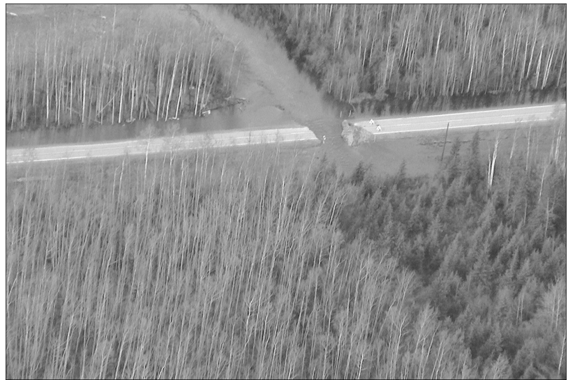
One of the three breaches DOT cut in order to relieve the flood waters.