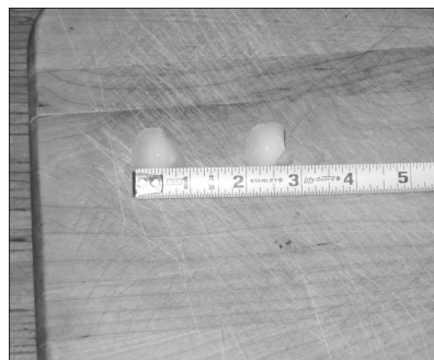
1" diameter hailstones caused some minor damage to this truck in Fairbanks.

unusual weather was seen descending from several convective cells the previous week, when meteorologists at the Weather Forecast Office in Fairbanks, some University of Alaska personnel, and the news media reported several apparent funnel clouds over Fairbanks.