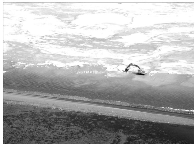
DOT frantically digs a channel in the overflow ice to keep spring runoff from the Dalton Hwy.