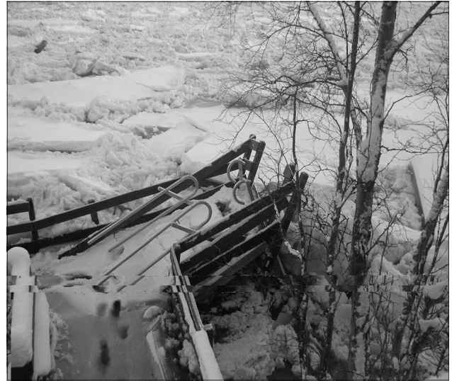
Damaged stairway at the Kenai River Center

release, we expected that it would release earlier than normal, but during open water season, in 2007. In open water conditions, the release of the Skilak glacier dammed lake typically causes a rise of several feet, but usually occurs in the fall when water levels are low, and thus is not a significant flood threat. In mid January an otherwise unexplained rise in river levels was indicated by the stream gages and was confirmed by river observers. The