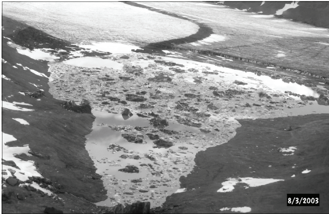
Skilak glacier dammed lake

The Skilak glacier dammed lake in the Kenai River basin was expected to release in the fall of 2006, since its previous release was in October of 2004 and the lake typically has a 2 to 3 year filling cycle. When it did not