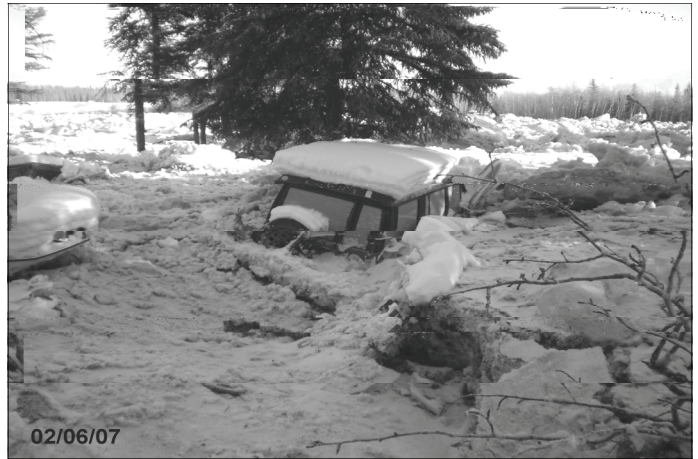
Car surrounded by ice following the release of Tazlina West glacier dammed lake

residents. The resulting ice breakup caused extensive flooding, with ice reportedly reaching nearly to the underside of the Richardson Highway bridge. Some homes along the river reported water up to the interior electric wall sockets. Besides inundation of an unknown number of homes, numerous cars, snow machines, and outbuildings were damaged or destroyed by ice. There