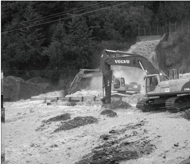
Lowell Point in Seward