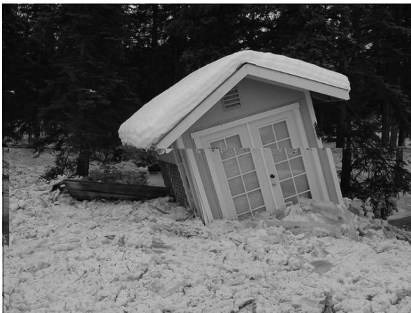
Damage to an outbuilding caused by the release of the Tazlina West glacier dammed lake

winter. This lake likely began to release in late January, but without an automated gage on the river, the initial rise in water level on the Tazlina River was not detected. Rising water levels went unnoticed until Saturday February 3 rd , when the ice breakup front that was caused by the rising water level progressed downstream to the Richardson Highway bridge and residences in the vicinity of the bridge. Water levels were reported to have risen very fast Saturday night, frightening the local