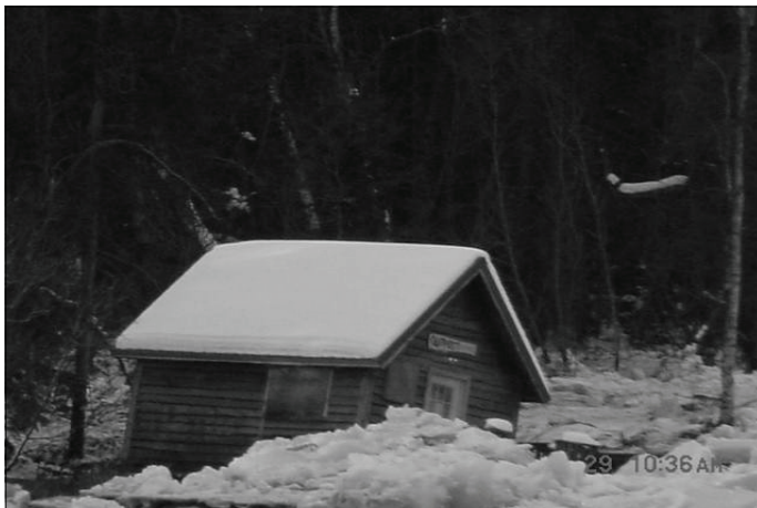
Damaged cabin on the Kenai River

release, we expected that it would release earlier than normal, but during open water season, in 2007. In open water conditions, the release of the Skilak glacier dammed lake typically causes a rise of several feet, but usually occurs in the fall when water levels are low, and thus is not a significant flood threat. In mid January an otherwise unexplained rise in river levels was indicated by the stream gages and was confirmed by river observers. The