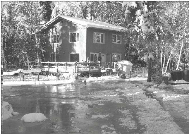
Overflow from Goldstream Creek surrounds a cabin near Fairbanks back in February

The cold and dry conditions resulted in considerable overflow icing of creeks and rivers during the winter. There were several reports of overflow inundating private property and causing groundwater levels to rise and dampen some home owners' crawl spaces. The excessive overflow ice has also kept the Department of Transportation busy trying to keep culverts thawed out and water from flowing over roadways. The abundance and thickness of ice on creeks and rivers does have some residents concerned that there may be a higher risk of ice jams during breakup. Fortunately the amount of water in the snowpack is low this year and the amount of runoff into the river systems will be much lower than normal.