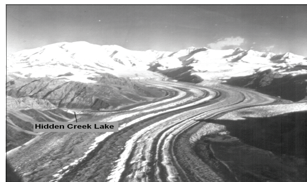
Hidden Creek glacier dammed lake