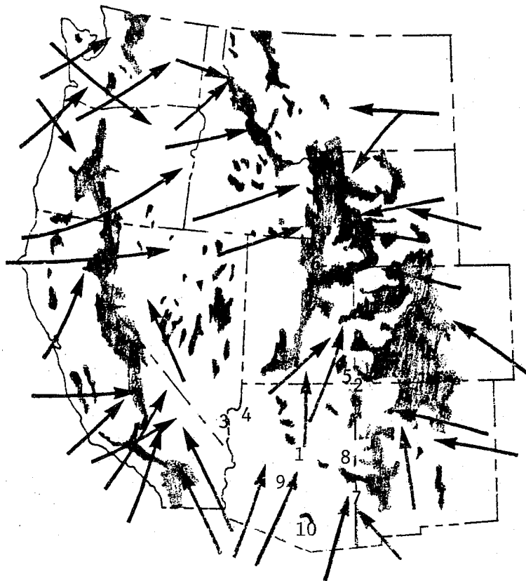
Figure 1. Principal Paths of Moisture Inflow in the Western United States for Storms Producing Large Precipitation Amounts. Toned Areas are Major Orographic Barriers.

developed a precipitation atlas used to estimate six-hour and 24-hour precipitation amounts for return periods of from two to one-hundred years for eleven (11) western states. The authors analyzed physiographic factors by regions considered to be meteorologically homogeneous. The extent of each region was determined from consideration of the weather situations that could be expected to produce large precipitation amounts. Among the questions asked and answered were: What is the source and from what direction does moisture for major storm come, and are there major orographic barriers that influence the precipitation process? Figure 1 shows some of the principal paths of moisture inflow for the western United States and the major orographic barriers to such flow.