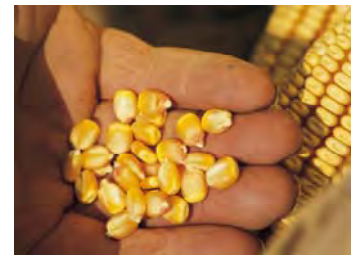
In 2010, U.S. farmers harvested more than 12.4 billion bushels of corn valued at about $66 billion dollars.