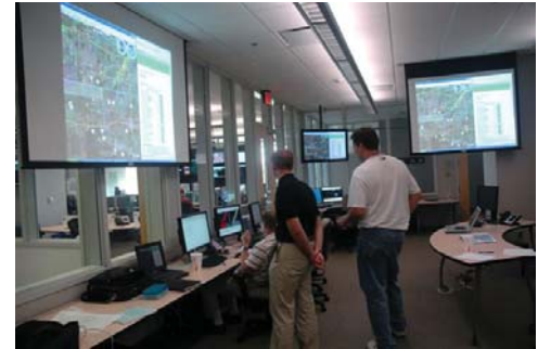
HWT facilities in the National Weather Center

The HWT provides a unique setting that encourages interaction between researchers and the people who most benefit from research – forecasters. The HWT facilities include a combined forecast and research area placed between the operations areas of the SPC and OUN, and the NSSL Development Lab located nearby. The development lab includes four wall-mounted plasma screen displays and enough space for at least 10 workstations. Researchers, forecasters and developers use the lab to evaluate new platforms and techniques in real-time as a team. Collaboration among these diverse groups provides valuable feedback that can immediately be applied to the research and development process, streamlining technology transfer.