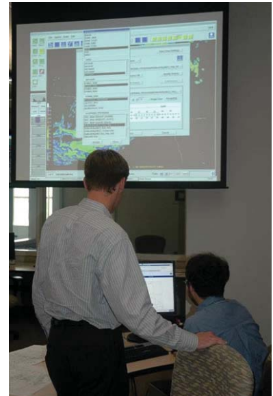
Researchers in the Hazardous Weather Testbed track storms with experimental tools during the annual Spring Experiment.

Hazardous weather research payoff: An effective NWS severe weather forecast and warning program must provide the public with critical weather information including sufficient advance notice of impending hazardous weather.