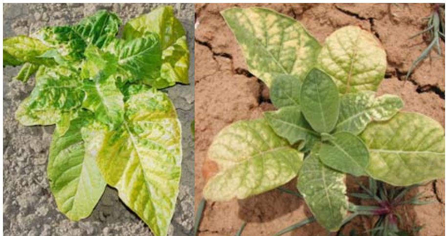
Injury from acetolactate synthase inhibitors.

residue would indicate that it is safe to plant tobacco. Residue levels between 0.05 and 0.19 ppm would indicate a potential for injury, but symptom development might depend on weather conditions. Levels at 0.2 ppm and above indicate that injury is likely, and tobacco should not be planted. Instructions for submitting a sample for a triazine test are available through your local county Extension office. Symptoms of foliar uptake from drift or direct sprays may look similar to those of a contact herbicide.