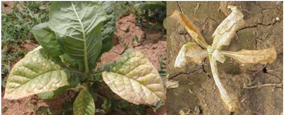
Aim contact injury drift versus Gramoxone direct contact.

Prowl controls annual grasses and certain broadleaf weeds in tobacco. The main symptom to look for is restricted and nubby roots which may cause stunting. Symptoms are more common when plant roots are transplanted into the treated zone. Incorporation of the her-