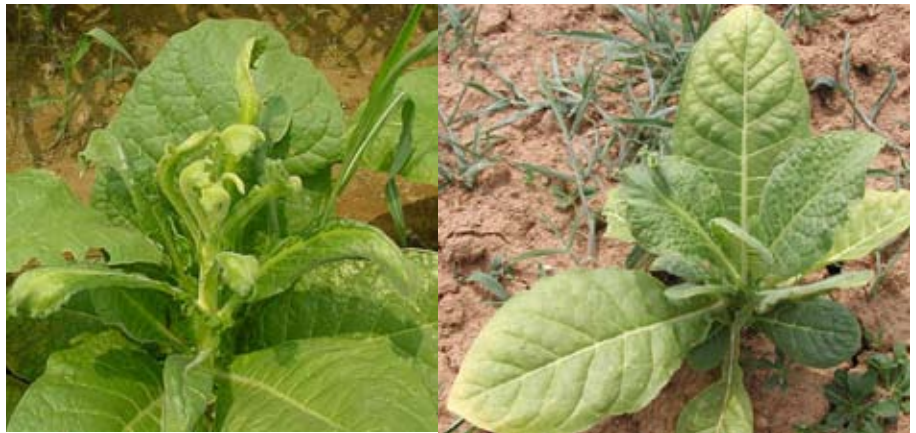
Injury from growth regulators or synthetic auxins.

Source: Burley Tobacco Field Manual , R.J. Reynolds Tobacco Company.