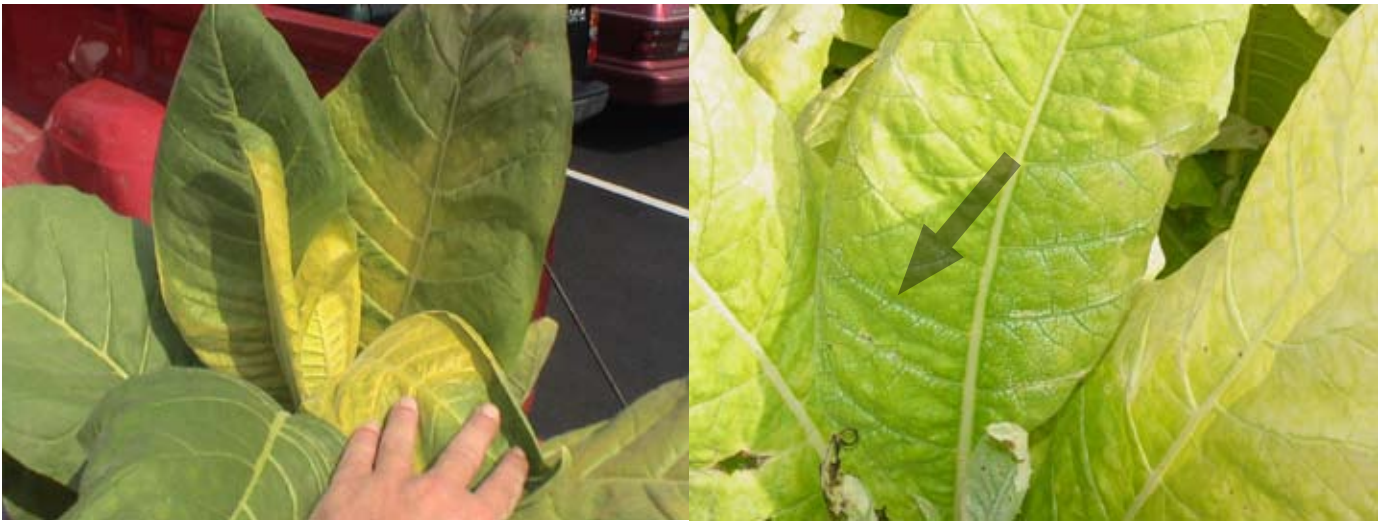
Injury from glyphosate.