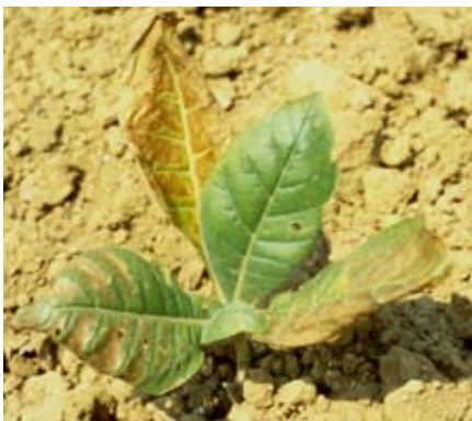
Injury from triazines.

Tobacco rotated into a field that was in corn the previous year where a triazine herbicide such as atrazine was used should be tested for the presence of triazine in the early spring prior to planting. A soil sample with less than 0.05 ppm of total triazine