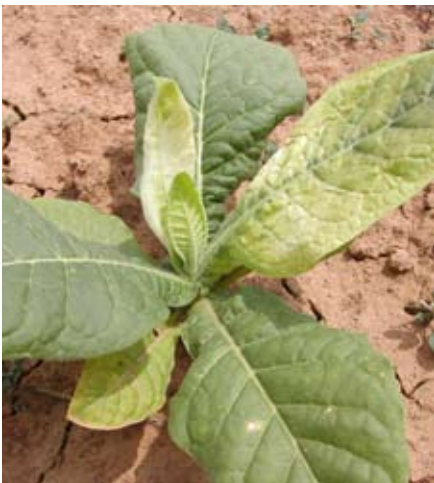
Callisto damage in tobacco can look like glyphosate injury.

Chlorophyll inhibitors like Callisto control broadleaf and certain grass weeds in corn. Callisto is quickly translocated and inhibits an enzyme that is essential to photosynthesis and plant growth. The general appearance is a whitening or chlorosis of the leaf tissue which may be confused with glyphosate or Command damage. (See Command under “Injury from Chemicals Labeled for Tobacco Use” below.)