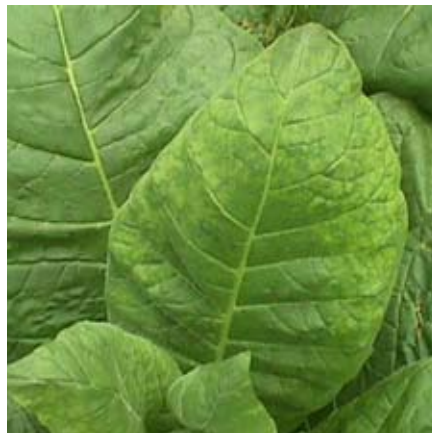
Yellowing from Actigard.