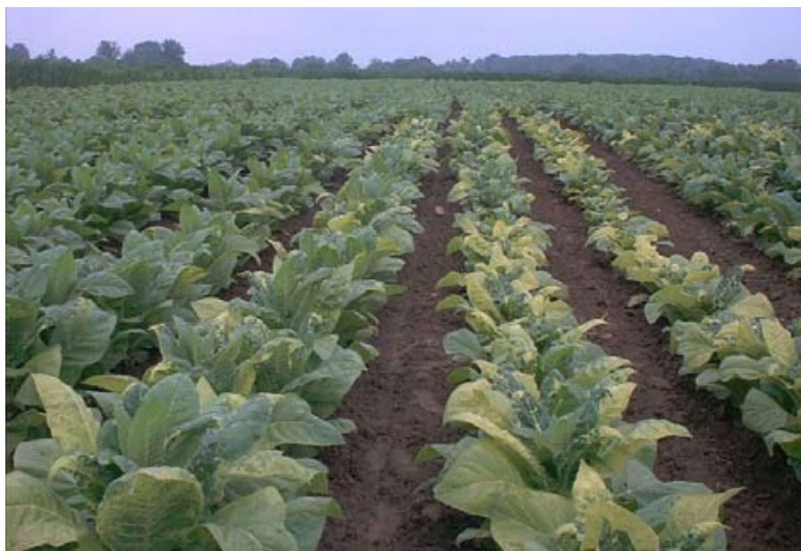
Tobacco fields with chemical drift damage like that above may recover or, as the case with some pesticides, may suffer permanent damage.

Often little regard is given to sprayer nozzles from year to year. If inappropriate nozzles are used for pesticide application, they may cause irregular application, be more susceptible to drift, or produce excessive residues. It is often undesirable to use one set of nozzles for applications of different pesticides. Using the appropriate nozzles will assure better coverage and therefore better control. As a general rule, flat fan nozzles are recommended for most broadcast applications of herbicides. However, other nozzles may be more ap-