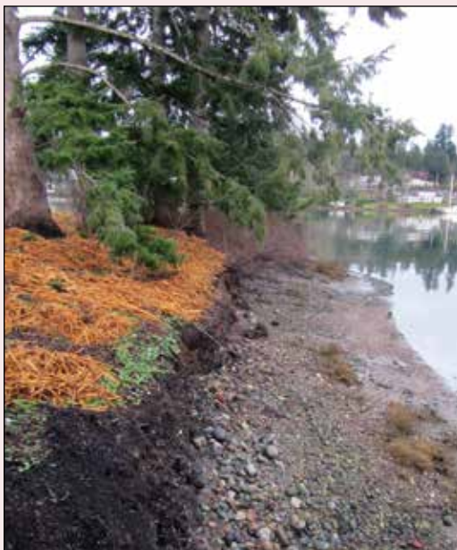
With the Powels' bulkheads gone, native forest plants take root above and pickleweed and other intertidal plants emerge below.

Kehers says family members are delighted with the outcome, and even one brother who doubted the project now grudgingly concedes its success. Carman publicly touts it as "a great example of complexity and collaboration." Following its completion, "I gave a presentation to our habitat program quarterly meeting in Olympia. I used the Powel project as a positive example of what we can do — after all the dire reports, here's a good one!"