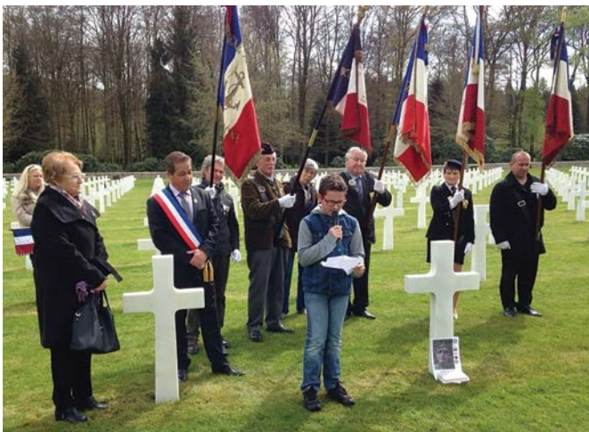
Citizens from the village of Quenoche, France attended the adoption ceremony for three soldiers buried at Epinal American Cemetery.