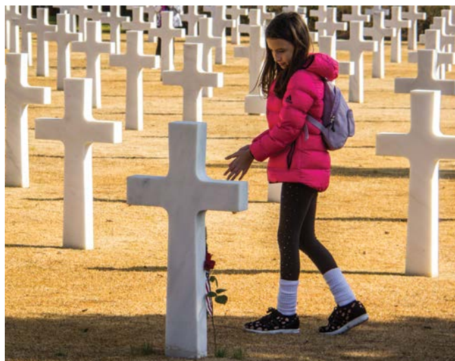
On the 73rd anniversary of the Allied landings at Anzio and Nettuno, students laid a red rose at the headstone of every member of the 82 nd Airborne buried at Sicily-Rome American Cemetery.