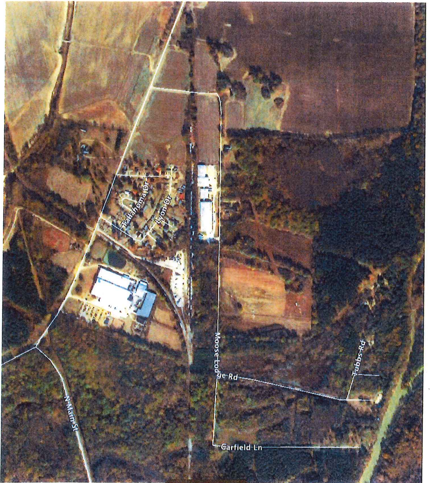
tabbles EXHIBIT B