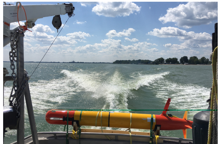
Scientists deploy underwater autonomous vehicles to test environmental sampling for 'Omics research in Lake Erie.

'Omics approaches can be paired with autonomous platforms to magnify what we can achieve with normal boat operations, for example, by extending our reach to areas that are deep, under ice, or too sensitive for normal trawl sampling. In collaboration with partners, AOML is testing autonomous underwater vehicles (AUVs) that can collect, filter, and process water samples to track harmful algae and their toxins and to investigate microbiome-fisheries connections. Partners include the Monterey Bay Aquarium Research Institute (MBARI), Great Lakes Environmental Research Laboratory (GLERL), National Centers for Coastal Ocean Science (NCCOS), Marine Biodiversity Observing Network (MBON), and Southwest Fisheries Science Center (SWFSC). AOML has also developed inexpensive subsurface auto-samplers (SAS) for the collection and preservation of environmental DNA (eDNA) from shallow underwater areas.