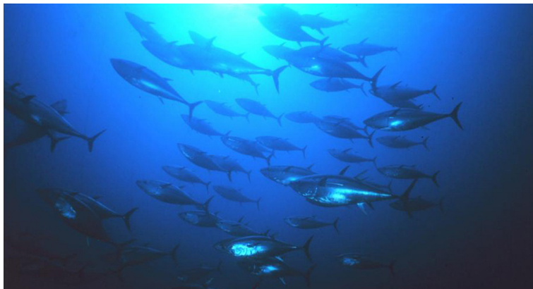
Atlantic Bluefin Tuna.

Our ability to effectively manage fisheries is limited by our understanding of fishery populations and their dependence on environmental conditions. Including genomic information into fisheries management may improve the decision-making process and thus the sustainability of fisheries. AOML and NOAA's Southeast Fisheries Science Center (SEFSC) have formed a collaborative partnership with a clear path to transition results into fisheries management plans. In addition to genomic investigations of fish populations, sustainable fisheries require holistic ecosystem understanding, and eDNA offers a cost-effective way to gather comprehensive biodiversity information.