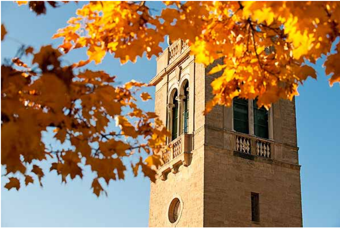
Framed by orange leaves, the Carillon Tower at the University of Wisconsin- Madison is pictured during autumn on Oct. 27, 2009.