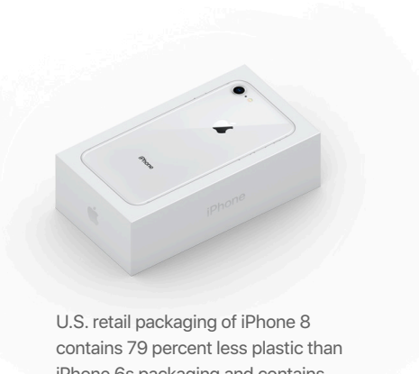
U.S. retail packaging of iPhone 8 contains 79 percent less plastic than iPhone 6s packaging and contains 59 percent recycled content.