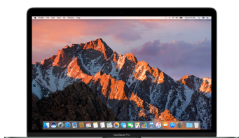
Models MLH32, MLH42, MLW72, MLW82 Date introduced October 27, 2016