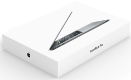
U.S. retail packaging of the 15-inch MacBook Pro contains an average of 38 percent recycled content by weight.