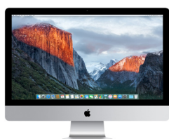
Models MK142, MK442, MK452 Introduced October 13, 2015