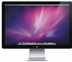
Model MC007 (27-inch)