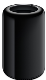
Models ME253, MD878 Date introduced October 22, 2013