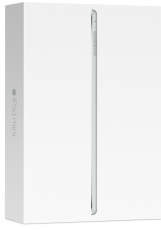
Retail packaging for iPad mini 4 uses a minimum of 38 percent post-consumer recycled content.