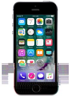
Date introduced March 21, 2016