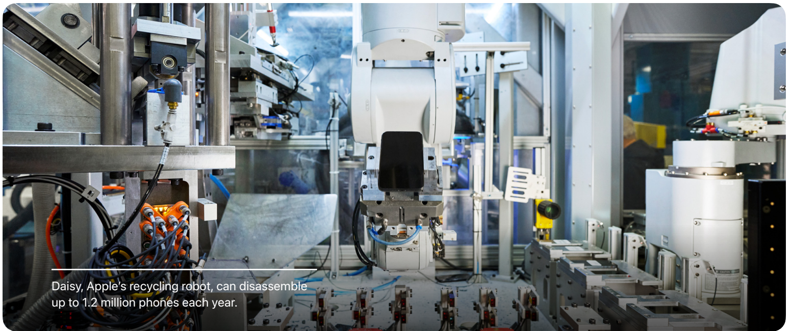
Daisy, Apple's recycling robot, can disassemble up to 1.2 million phones each year.