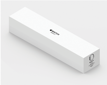
Apple Watch Series 3 (GPS) retail packaging contains at least 39 percent recycled content.

The retail packaging for Apple Watch Series 3 (GPS) is highly recyclable, and 100 percent of the fiber in its retail box is from either recycled content, bamboo, waste sugarcane, or responsibly managed forests. The following table details the complete set of materials used in the Apple Watch Series 3 (GPS) packaging. 1