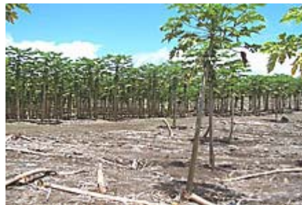
Fig. 8. PRSV is still in Puna, and more infections are occurring among the non-transgenic Kapoho. This site shows the dramatic difference between a block of nontransgenic papaya (foreground) adjacent to a block of transgenic Rainbow (background). Nontransgenic trees that became infected were cut down as seen in foreground. Plants were established at the same time. Picture taken in 2004.

Guard against large scale resurgence of PRSV in nontransgenic papaya in Puna. Despite the efforts to protect nontransgenic Kapoho from PRSV, observations suggest that PRSV infections are increasing in nontransgenic papaya in Puna (Fig. 8). As virus inoculum builds up in Puna, it will become more difficult to economically produce nontransgenic papaya. Strict attention needs to be paid to planting nontransgenic papaya in as much isolation as possible, doing timely elimination of infected trees, and to plowing under nontransgenic plantings that are no longer in production. The latter will reduce the amount of available PRSV inoculum.