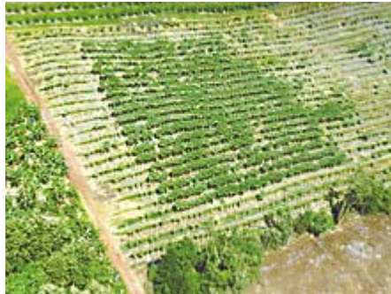
Fig. 2. Kapoho field trial started in 1995, showing a solid block of PRSV-resistant Rainbow growing well while the surrounding susceptible non-transgenic Sunrise is severely infected with PRSV. Picture taken 19 months after start of the field trial.

virus-susceptible Sunrise. PRSV inoculum source existed in a nearby infected block of nontransgenic Sunrise as well as selected Sunrise plants in the border rows that were mechanically inoculated with PRSV. The results were dramatic, all nontransgenic plants became infected within 11 months of starting the field trail while none of the transgenic test plants became infected (Fig. 2 and 3). This resistance was still evident up to termination of the trials in early 1998. The transgenic Rainbow yielded an estimated 125,000 lbs per acre per year, as compared to 5,000 lbs per acre per year for the nontransgenic Sunrise.