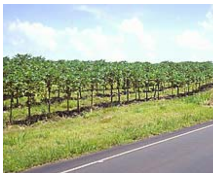
Fig. 7. By 1999 healthy fields of transgenic papaya were commonly seen as opposed to the period of 1994-1998 where it was very difficult to find healthy papaya fields in Puna (see Fig. 1A). Picture taken in 1999.