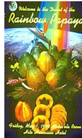
Fig. 4. Front cover of a brochure distributed during the celebration on the inaugural seed distribution of transgenic Rainbow and SunUp to growers on May 1, 1998.

Transgenic line, 55-1, the parent of SunUp and Rainbow, was deregulated (3) within two years after documents were submitted to the Animal Plant Health Inspection Service (APHIS), the Environmental Protection Agency (EPA), and the Food and Drug Administration (FDA). APHIS considered the impact on agricultural environments, EPA considered the pesticidal aspect of the viral coat protein produced by the transgenic papaya, and consultation was held with FDA which considered the food safety aspect of the transgenic papaya. Licenses that were needed to commercialize the transgenic papaya were obtained by April 1998. Seeds were distributed to growers on May 1, 1998 following a celebration held in Hilo, Hawaii (Fig. 4). Efforts to deregulate the transgenic papaya were carried out by the investigators and funding for deregulation and licensing was provided by the Papaya Administrative Committee (PAC), a grower organization regulated under a USDA marketing order. The transgenic papaya could now be used in efforts to translate the hope of controlling PRSV into a reality.