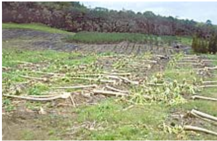
Fig. 5. PRSV infected papaya that were cut down in the foreground and healthy transgenic Rainbow papaya in the background. Resistance of Rainbow held up even under strong inoculum pressure of PRSV. Picture taken in 1999.

The resistance of the transgenic papaya under rather strong disease pressure allowed farmers to directly reclaim their farms without first clearing their land of all infected papaya trees. Common scenarios were to grow transgenic plants next to mature papaya plants, which were subsequently cut after the transgenic plants were established (Fig. 5), or to simply grow transgenic papaya among abandoned fields (Fig. 6). In all cases, the transgenic papaya remained virus-free. Within a year after the release of the seeds, it was rather common to see many fields of healthy Rainbow (Fig. 7) and this scene is still predominant in 2004.