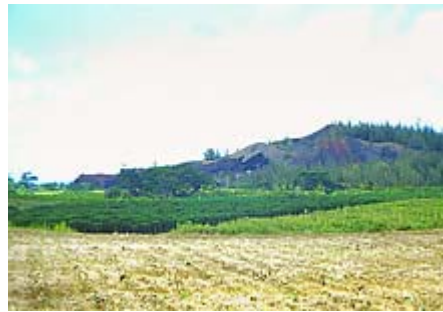
Fig. 6. Green healthy transgenic Rainbow papaya growing among PRSV-infected trees in an abandoned papaya field. Picture taken in 1999.