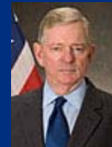
W. Ralph Basham Commissioner