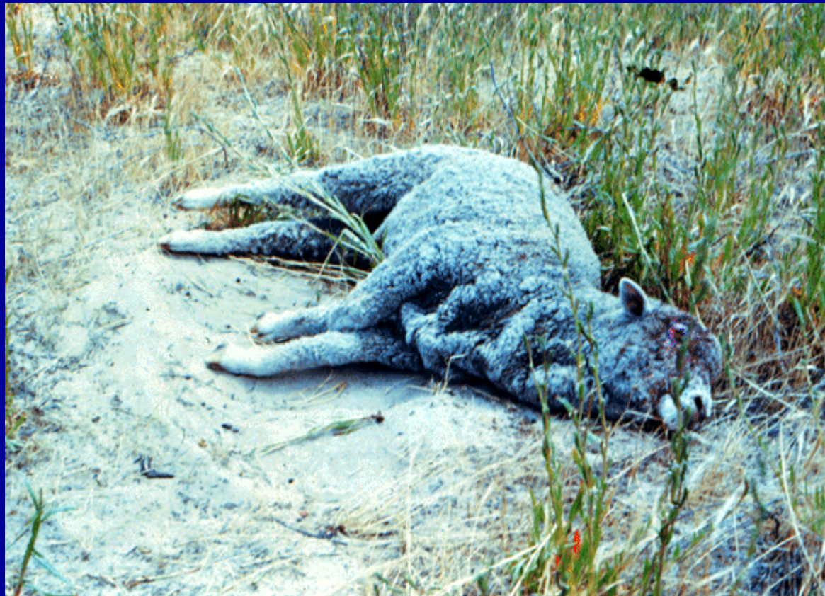
Dead sheep after eating infected annual ryegrass ( Lolium rigidum ) in South Australia