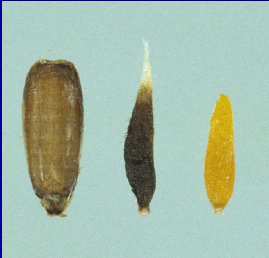
Healthy Lolium rigidum seed (left), Anguina funesta gall (center), and Rathayibacter toxicus colonized nematode gall (right)