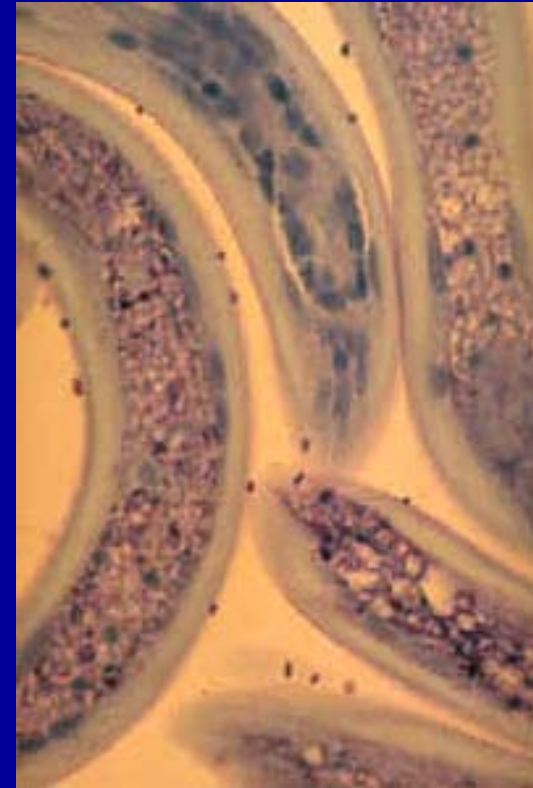
Nematode Anguina funesta juveniles with R. toxicus (seen as dark dots on the surface of nematodes) adhered to the cuticle