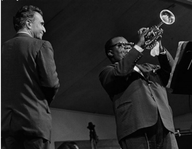
Dave Brubeck and Louis Armstrong perform at the 1962 Festival.

The Stanford Archive of Recorded Sound, which celebrates its 50th anniversary this academic year, contains about 350,000 sound recordings and 6,000 print and manuscript items, documenting all aspects of 20th- and 21st-century culture. It's one of the five largest sound archives in the United States.