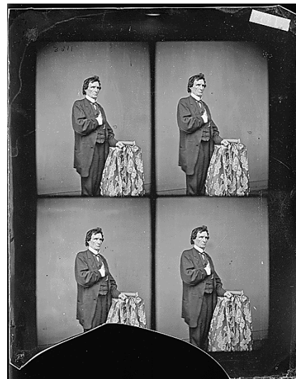
Thaddeus Stevens, glass plates. Records of the Office of the Chief Signal Officer, 1860 - 1882, National Archives.