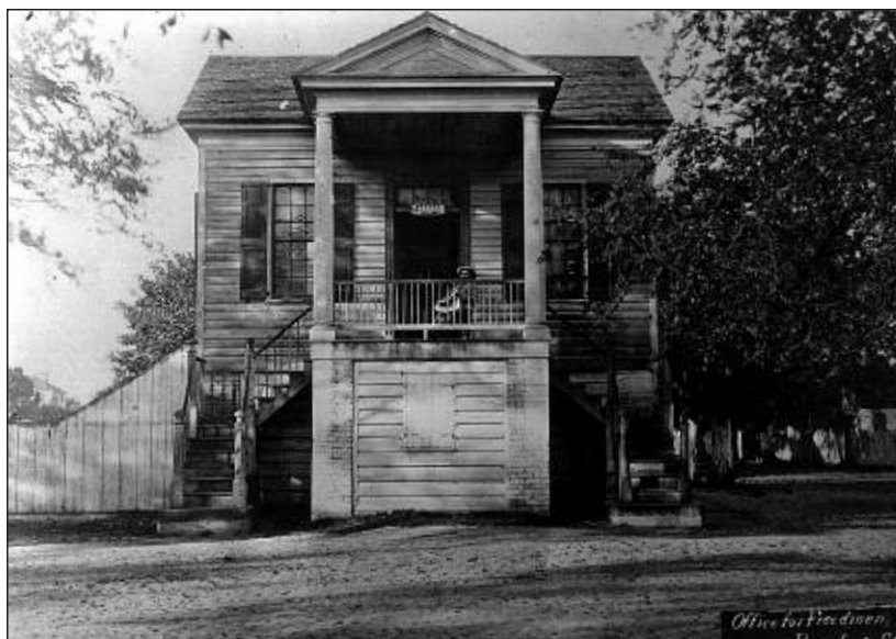
Most Freedmen came in contact with the Freedmen's Bureau at the local level such as at this office in Beaufort, South Carolina. (165-C-394)

Although the Bureau was not abolished until 1872, the bulk of its work was conducted from June 1865 to December 1868. While a major part of the Bureau's early activities included the supervision of aban-