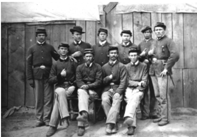
Union soldiers from the Army of the Cumberland awaiting court-martial. (111-B-2738)

Plante, Trevor K. "The Shady Side of the Family Tree: Civil War Union Court-Martial Case Files," Prologue , Winter 1998, Vol. 30, No. 4.