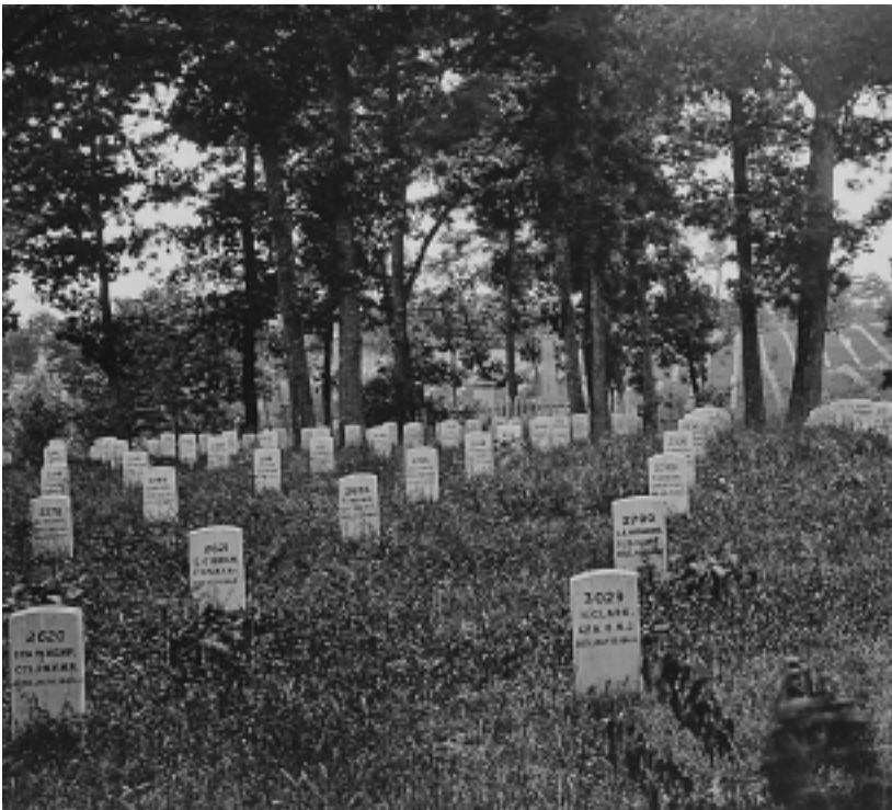
Civil War view of Arlington National Cemetery. (111-B-5304)

More than 40 years after the end of the Civil War, permanent, uniform markers were authorized for the graves of Confederate soldiers buried in national