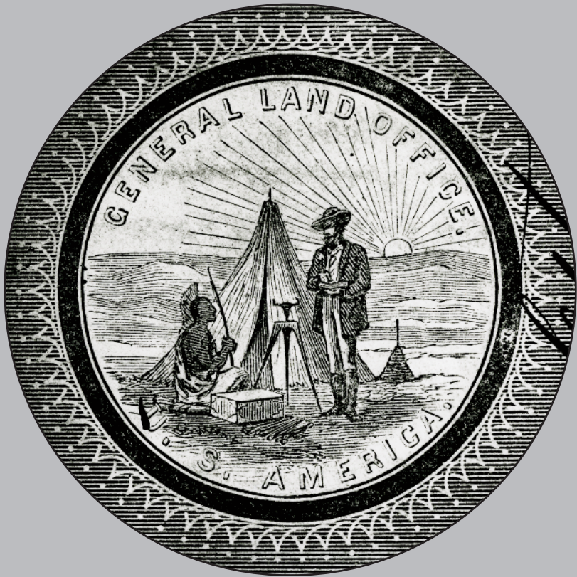
Above: The seal of the U.S. General Land Office, ca. 1861.