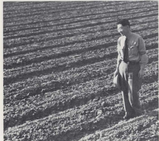
Fig. 34. "Looked lovingly at their land"