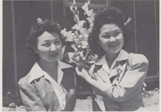
Fig. 23. "Arranged flowers"

The evacuation photographs speak to upheaval. Movement has started, disruption is apparent, but, with a few notable exceptions, the photographs are insufficient as historical evidence. Figure 26 is an eloquent protest by one Japanese-American. Dressed in his army uniform, this World War I veteran is being