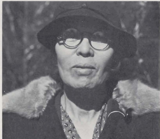
Fig. 29. "Woman with a label tucked into her coat"