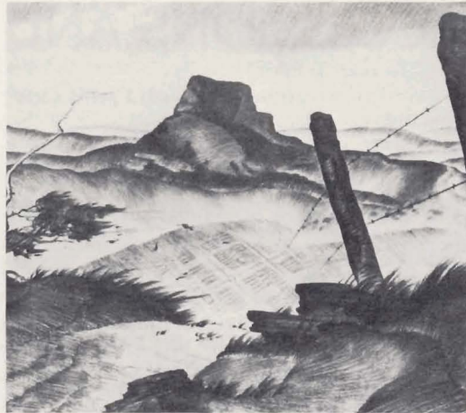
Fig. 40. "Isolation"

Most Americans are ashamed of this episode, but the focus is properly on the failure of leadership and the role of journalists in disseminating hatred and suspicion. Accounts that accent the lack of amenities in the camps during wartime are ludicrous. If the policy had been justified, its execution would have been admirable.