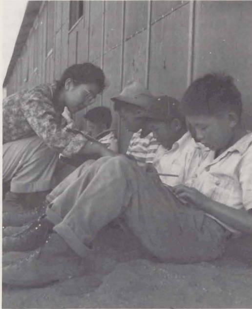
Fig. 22. "Established makeshift schools"

rectly, that personal strengths and youth aided adjustment to relocation and that disparity in lifestyle before and during the internment was less important. Jeanne Wakatsuki Houston, author of the first book, blames the relocation experience for her parents' marital problems, particularly her father's alcoholism and early death. Houston portrays her father as a restless non-conformist, often at odds with himself, whose sense of self-esteem was tied to his material possessions. The evacuation was traumatic, but one could rewrite the scenario and imagine that Wakatsuki's response to a draft call might have been the same. As described in Nisei Daughter , the effects of relocation on Monica Sone's family were altogether different. Personal strengths and family cohesiveness obtained in spite of the outrages committed against them. The treachery of Caucasians is recounted, but so are many acts of personal kindness.