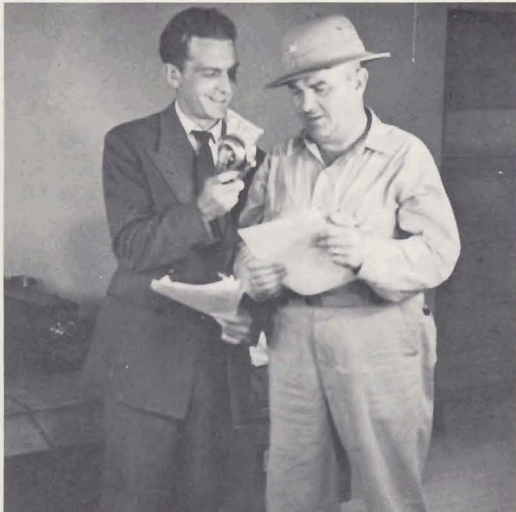
Fig. 39. "Reporters freely entered the camps"

tempt those who chose not to resist. 10 Jews of the Holocaust are alleged to have secretly desired their own deaths because they believed, as did the Japanese-Americans, that evacuation meant leaving their homes, not life itself, and that resettlement implied moving to another area, not that they would be exterminated. 11