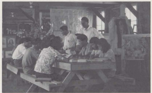
Fig. 24. "Painted pictures"