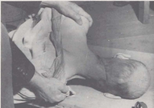
Fig. 7. "Suicide"