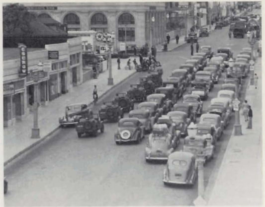
Fig. 31. "In their cars"