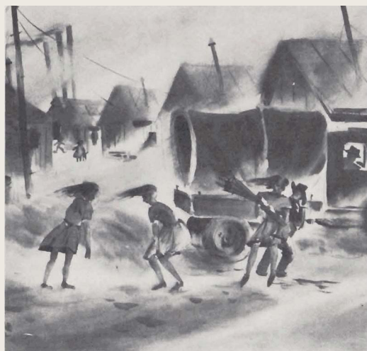
fig. 36. frequent dust storms