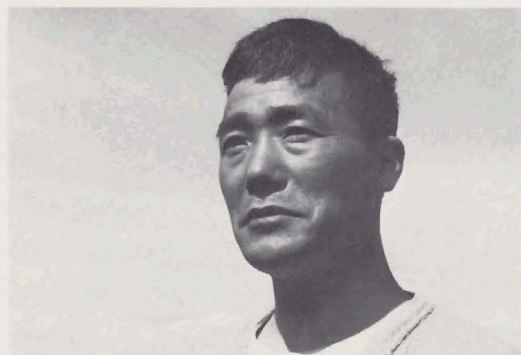
Fig. 18. "Portraits . . . made before evacuation"