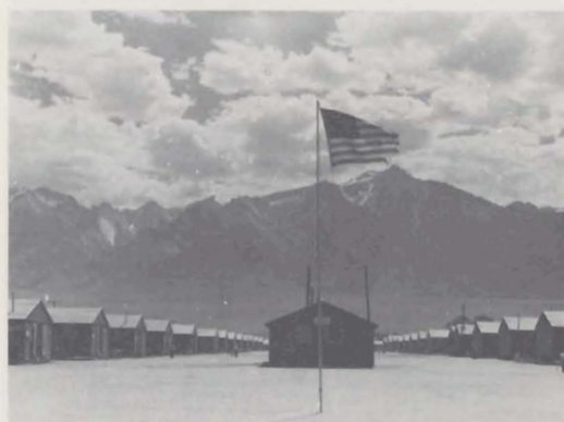
Fig. 9. "Crude, tarpapered buildings . . . recall military housing"

Figure 12, taken in front of the Japanese Independent Congregational Church, is evidence that acculturation was reflected in their religious life as well. Other preevacuation photographs document representative homes of Japanese-Americans: some poor and ramshackle, some typical of middle-income families, some revealing wealth and a high standard of living. Upon entering the United States,