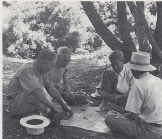
Fig. 28. "Played card games"