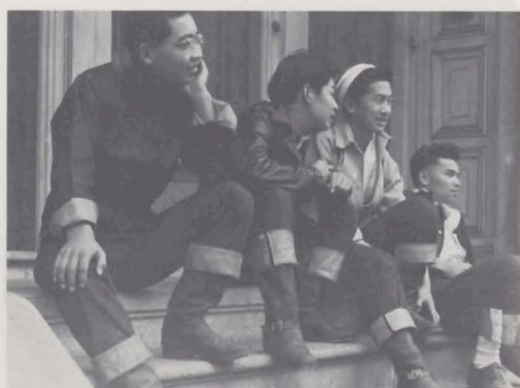
Fig. 10. "Teenage children"