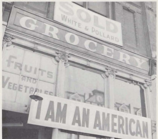
Fig. 25. "Movement has started, disruption is apparent"

evacuated. The irony is obvious. The photograph aptly conveys the veteran's statement. Figure 27 depends somewhat more upon the sensibilities of the viewer but is equally affective. An old, proud, well-dressed man sits with a label on him; he has been depersonalized, like a trunk to be moved. Similarly, figure 29