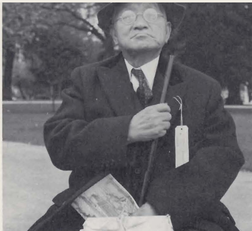
Fig. 27. "An old, proud man . . . sits with a label on him"