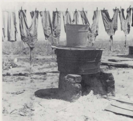
Fig. 33. "Hung out their last wash"