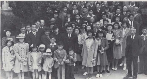
Fig. 12. "Japanese Independent Congregational Church"