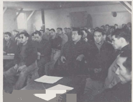
Fig. 8. "Meetings organized by block captains"