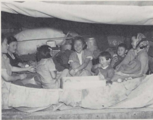
Fig. 30. "People leave town in trucks"