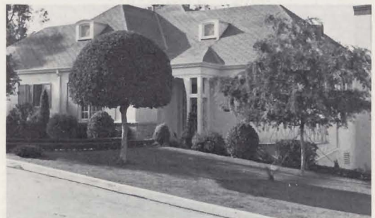
Fig. 15. "Some revealing wealth and a high standard of living"