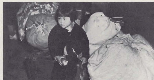
Fig. 20. "The child who cried at the evacuation"

The pictures suggest that even under bizarre circumstances people establish routines and recreate the familiar. The internees grew gardens for a hobby as they doubtless would have grown Victory gardens had they not been interned. They established makeshift schools, improved their living quarters, arranged flowers, painted pictures, fished, played card games, read, improved their English, and in general made a bleak environment livable.