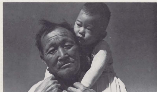
Fig. 19. "Faces juxtaposed against the sky"