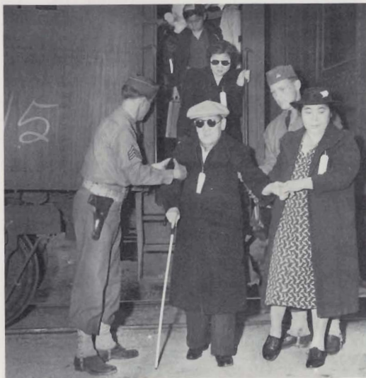
Fig. 32. "Incongruous military presence"

tion camps were not punitive; efforts to make life there more agreeable were not discouraged.