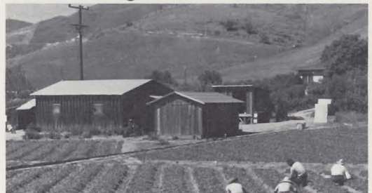
Fig. 16. "Rows of crops neatly cultivated in the camps"