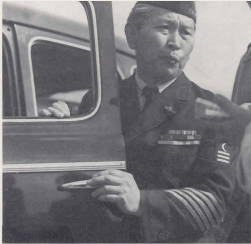
Fig. 26. "World War I veteran"

Just as the preevacuation photographs complement those of the camps, the evacuation photographs supplement those taken in the camps. The early shots show primitive quarters. Later ones show how the internées improved the barracks. Remembering that they were allowed to take only what belongings they could carry, we wonder how they obtained the improvements. Whatever the answers, the photographs show that the reloca-