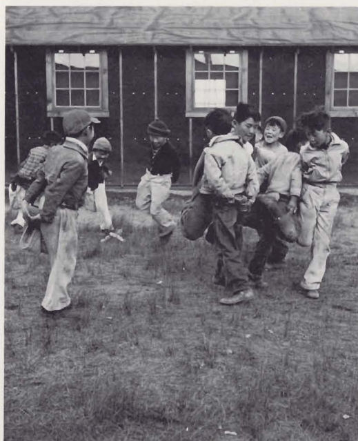
Fig. 21. "Earnest, often jovial children who later reappear in the camp"