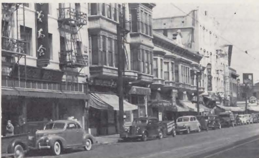
Fig. 11. "Little Tokyo"

Compared with photographs of the camps, the preevacuation shots assume greater significance. Images begin to repeat and recall earlier ones. Rows of crops neatly cultivated in the camps remind us of rows of crops in West Coast fields where Japanese laborers worked and where Japanese-Americans owned property. The people often appear tied to the earth, giving their labor and love to cultivation of the soil. Faces juxtaposed against mountains and skies recall portraits and landscapes made before evacuation. It is not the child who cried in the evacuation photos so much as the many earnest and often jovial children who later reappear in the camps.