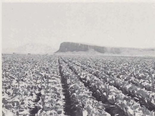
Fig. 17. "Crops in West Coast fields"